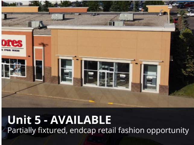
Unit 5 - AVAILABLE Partially fixtured, endcap retail fashion opportunity