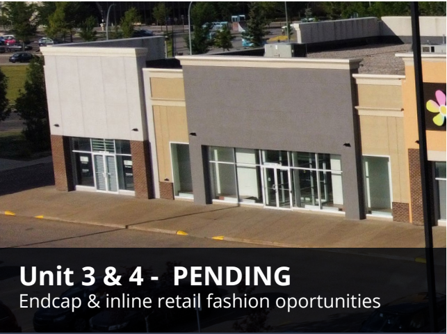
Unit 3 & 4 - PENDING Endcap & inline retail fashion oportunities