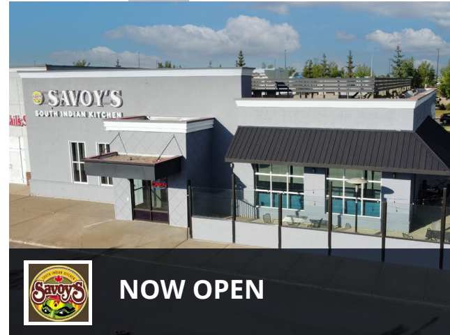
SAVOY'S NOW OPEN