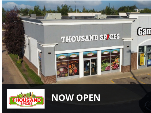
THOUSAND SPICES NOW OPEN