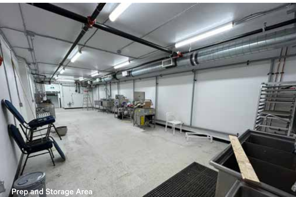
Prep and Storage Area