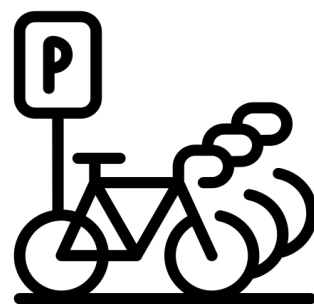
SECURED BIKE LOCKERS