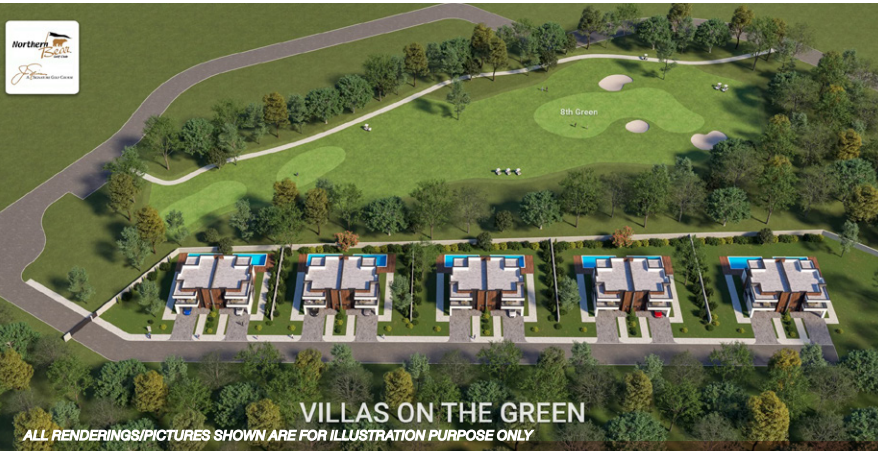
VILLAS ON THE GREEN

ALL RENDERINGS/PICTURES SHOWN ARE FOR ILLUSTRATION PURPOSE ONLY