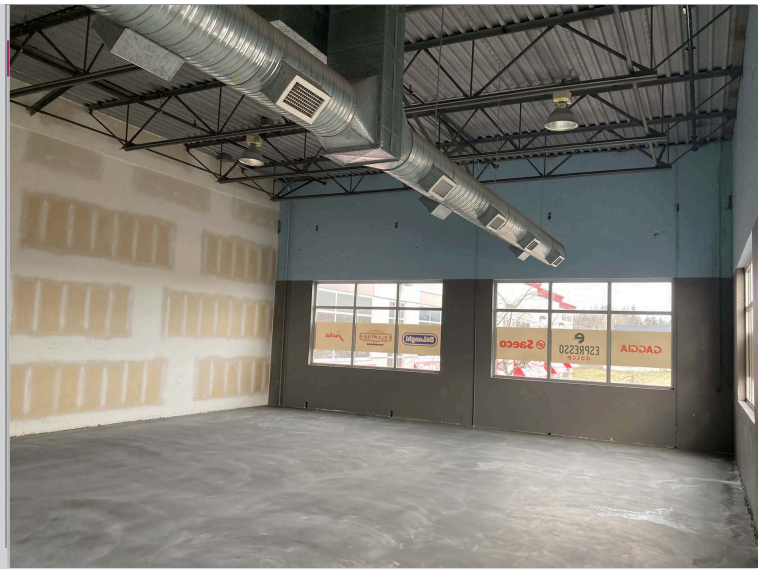
Two Level Unit

Willowbrook | Fraser Highway. 6039-196 Street | Surrey