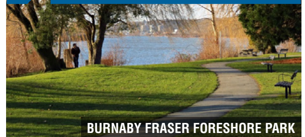
BURNABY FRASER FORESHORE PARK