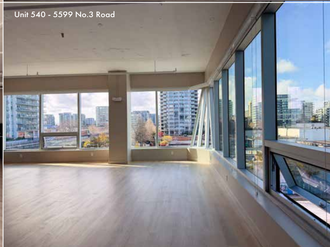
Unit 540 - 5599 No.3 Road