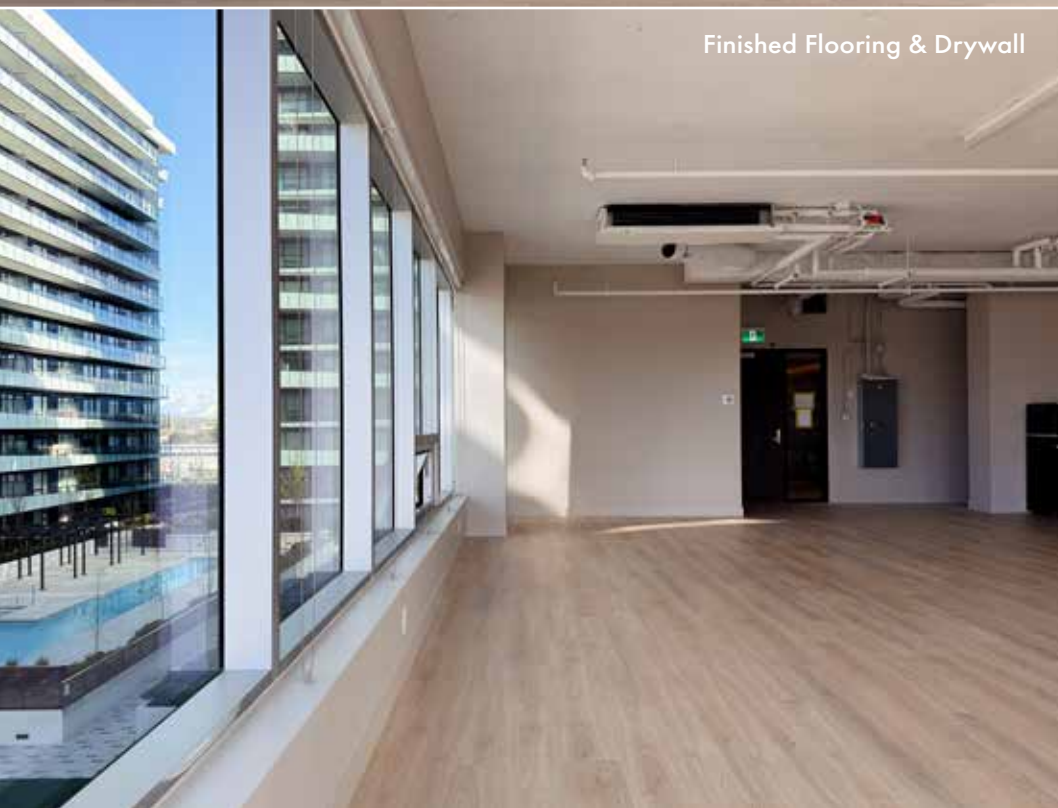
Finished Flooring & Drywall