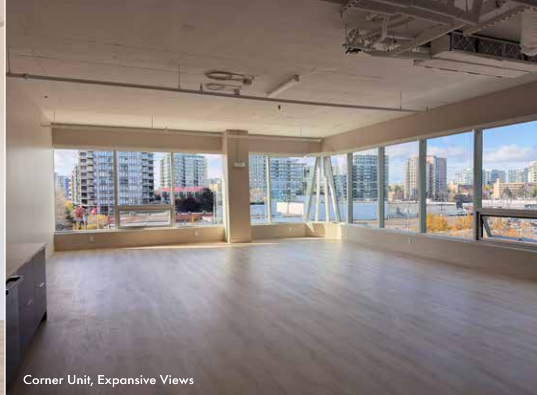
Corner Unit, Expansive Views