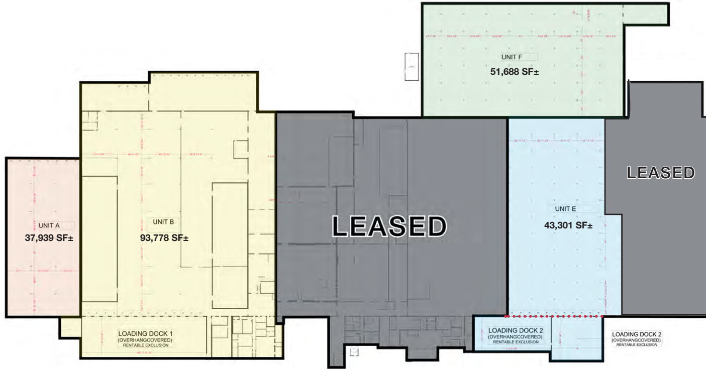
FOR ILLUSTRATIVE PURPOSES - NOT TO SCALE - NOT EXACT