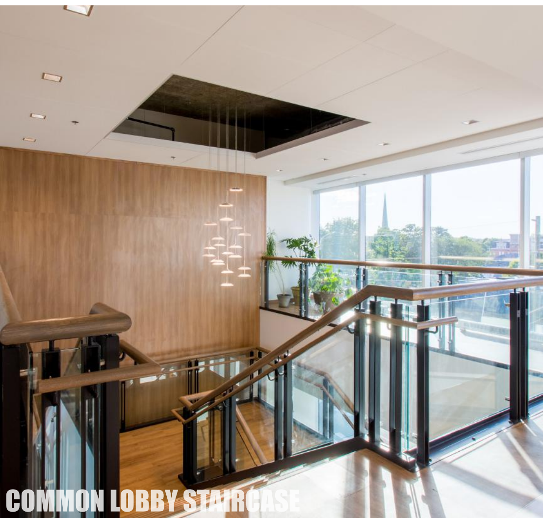
COMMON LOBBY STAIRCASE