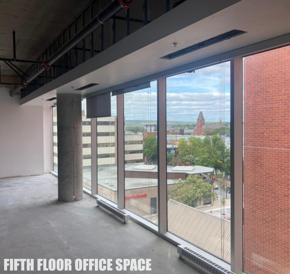
FIFTH FLOOR OFFICE SPACE