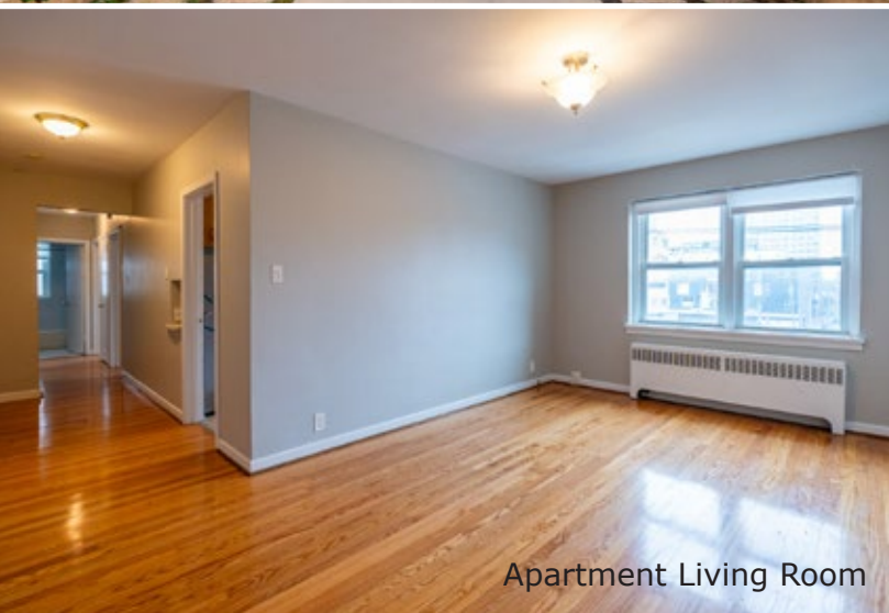
Apartment Living Room