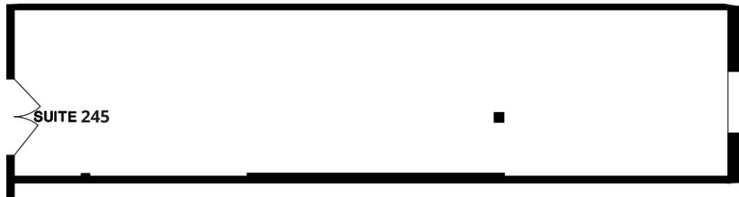
Unit 245 | 946 Square Feet