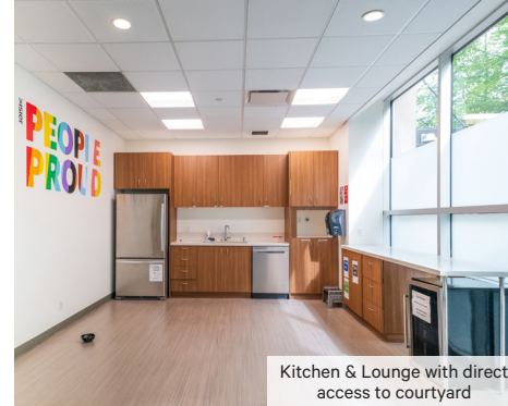
Kitchen & Lounge with direct access to courtyard