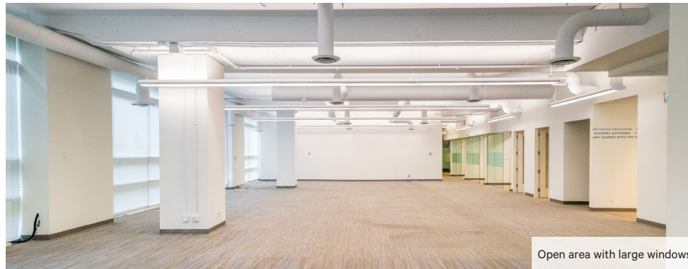
Open area with large windows