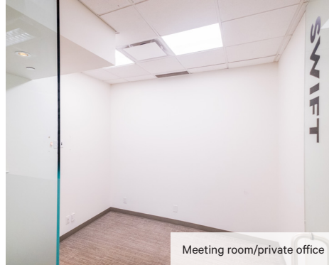
Meeting room/private office