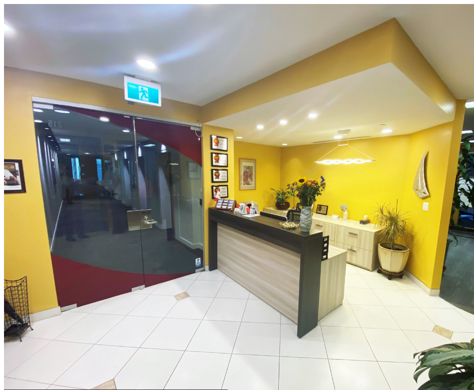
ELEVATOR EXPOSURE / RECEPTION