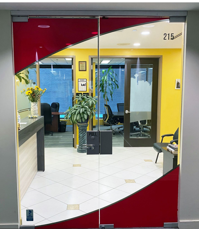
DOUBLE GLASS ENTRY