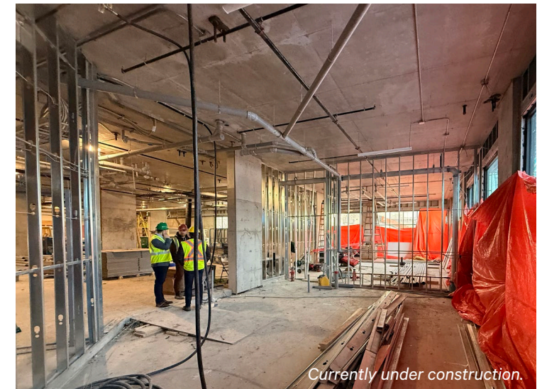
Currently under construction.