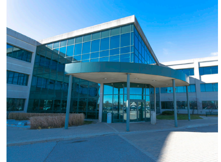
Exterior Front Entrance