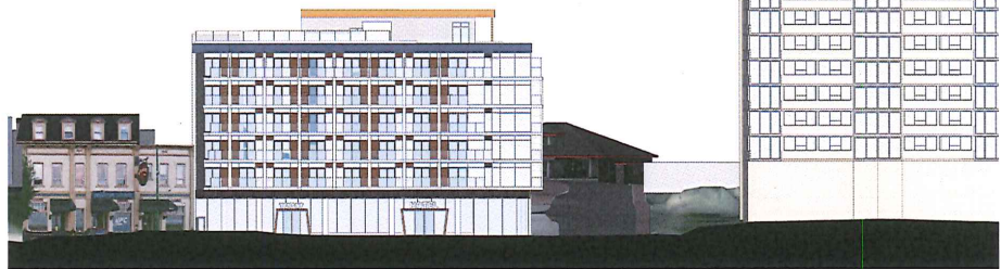
Front Street Context