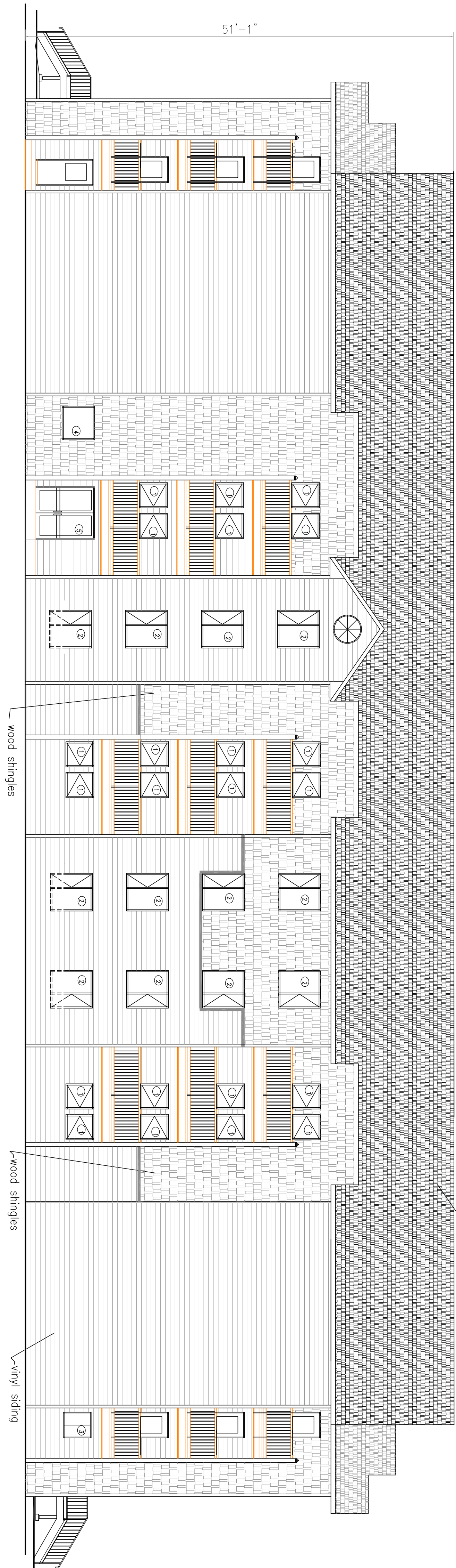
FRONT ELEVATION 1/8" = 1' - 0"