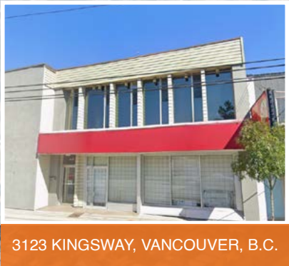
3123 KINGSWAY, VANCOUVER, B.C.