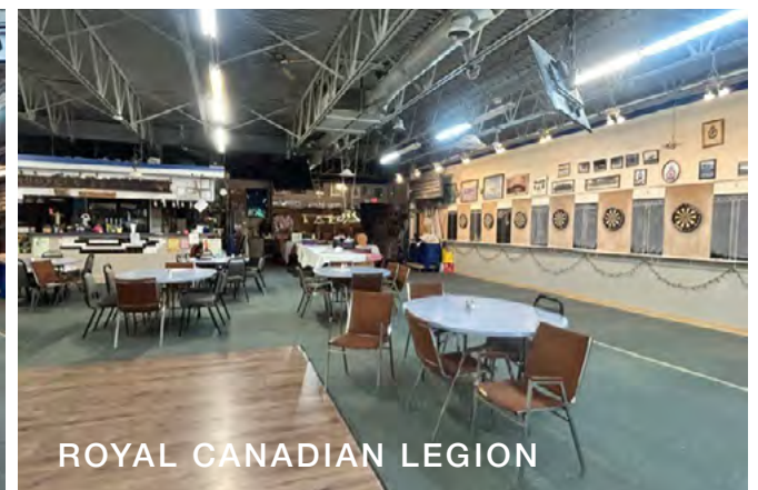
ROYAL CANADIAN LEGION