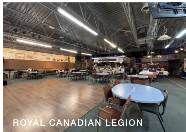
ROYAL CANADIAN LEGION