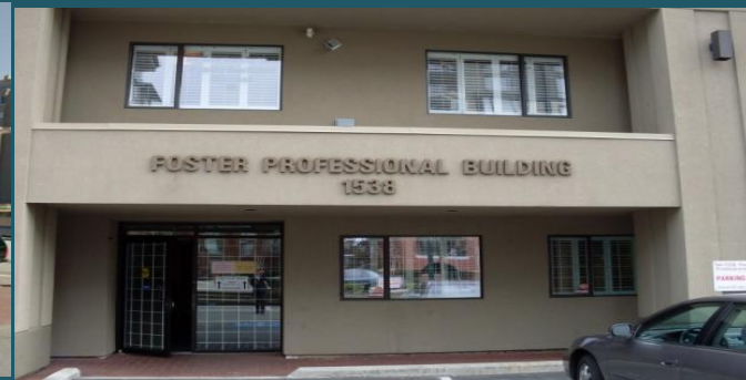
Excellent Layout and Professional Office Space