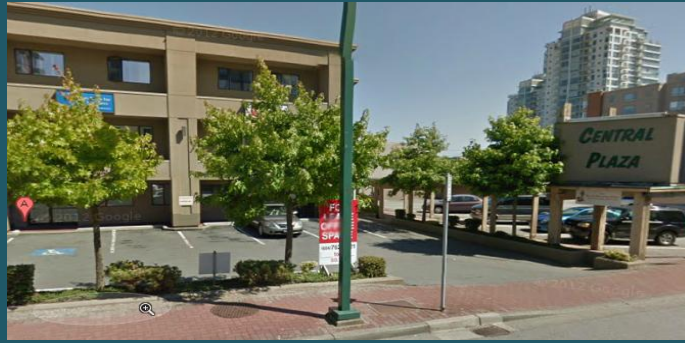
24 Hour Secured Access