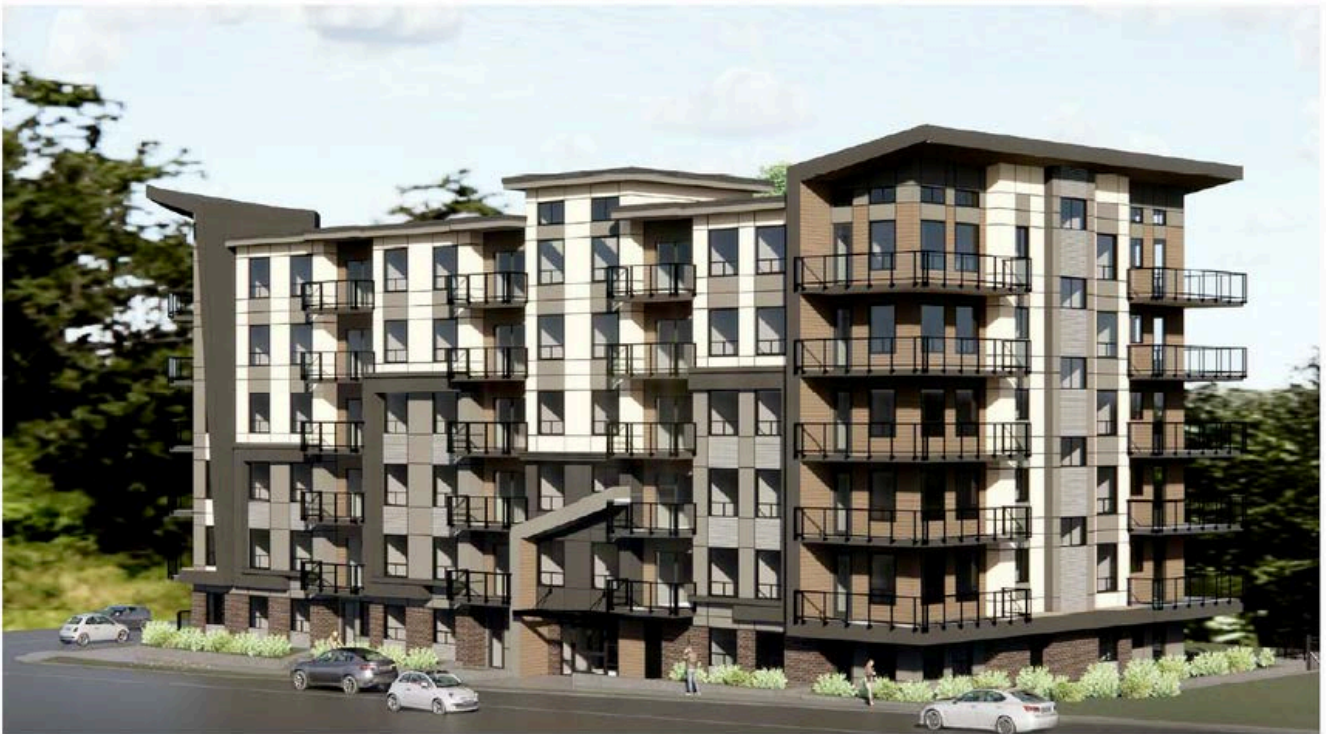
McCallum Looking North-East

Site Statistics No. of Units = 55 Floor Space Ratio (FSR) = 2.5 Total Parking Spaces = 71