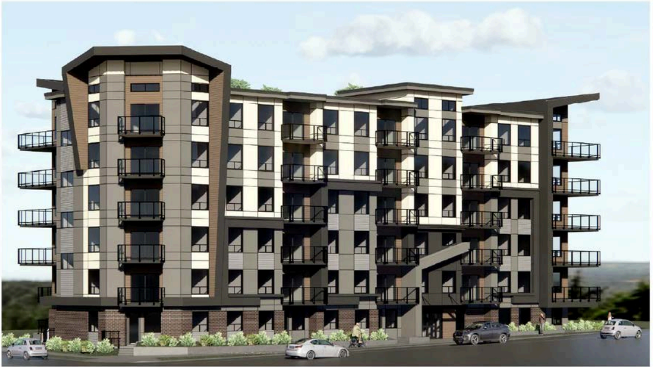
Corner of Busby & McCallum