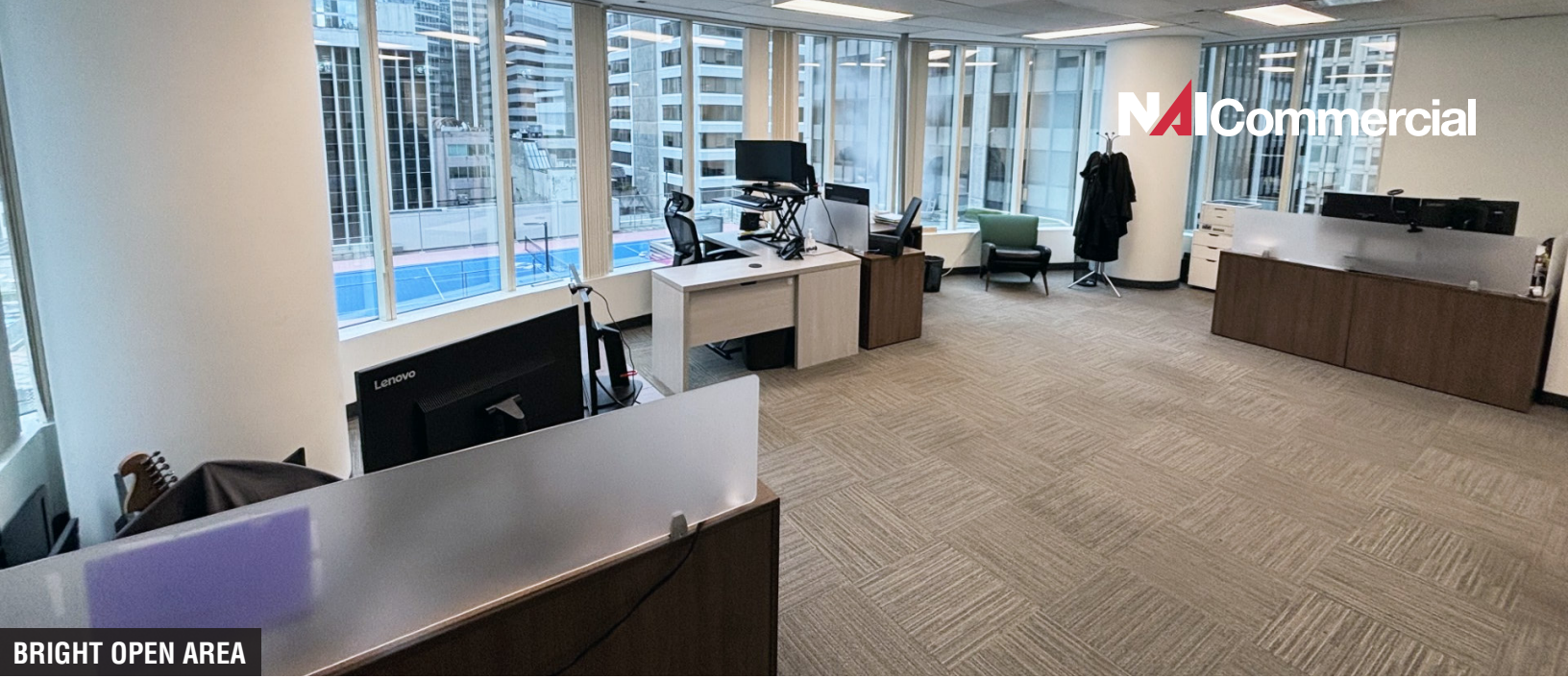
BRIGHT OPEN AREA