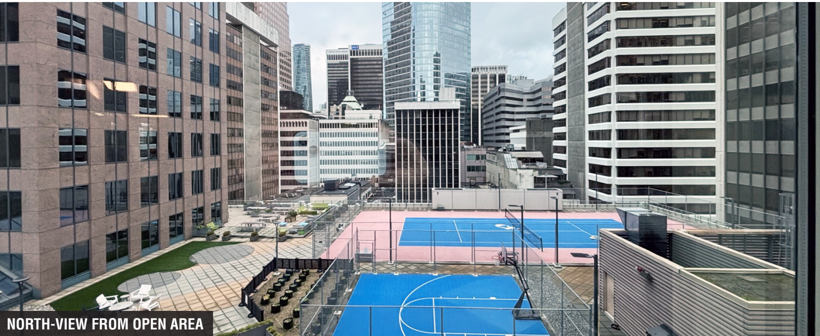
NORTH-VIEW FROM OPEN AREA