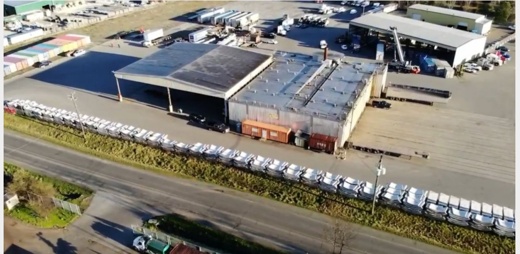
Building on the left, is the cooling shed, and the building on the right is the kiln building, they right beside one another