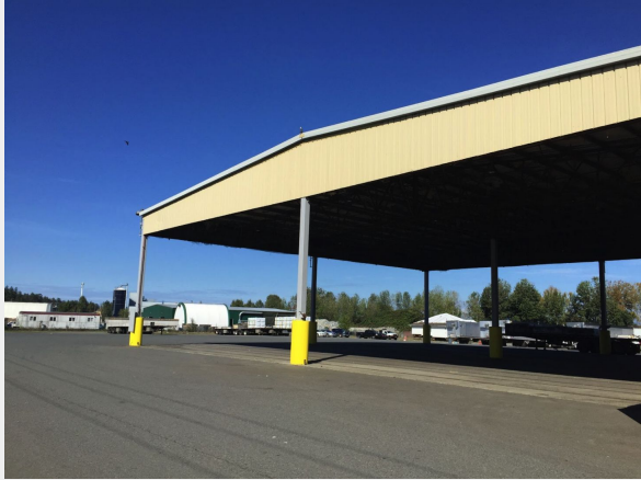
Building 3 (Cooling Shed)