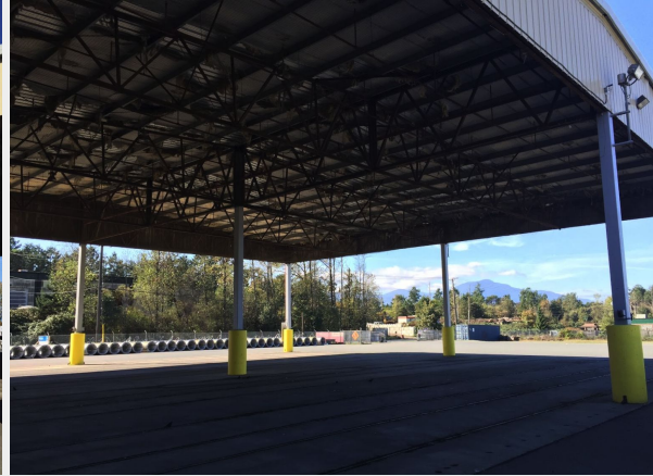
Building 3 (Cooling Shed)