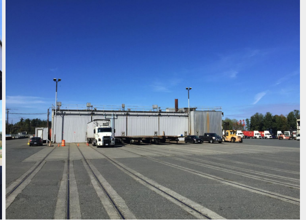
Building 4 (Kiln)