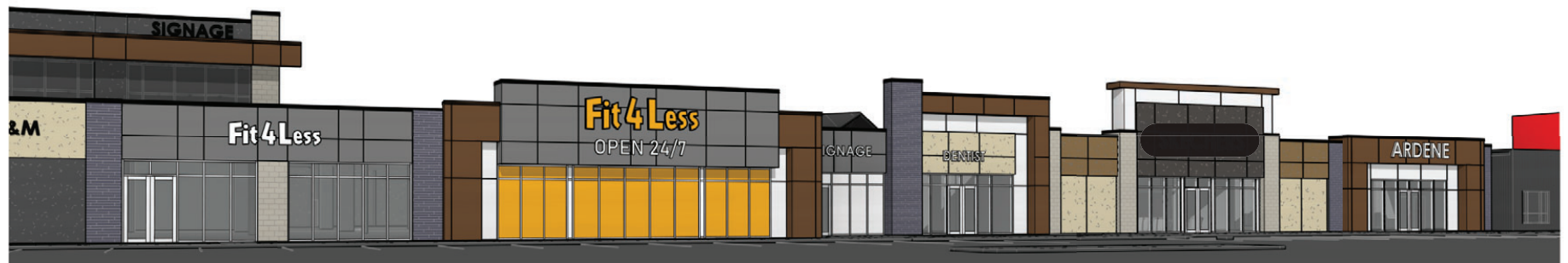
3D VIEW FROM SOUTH WEST