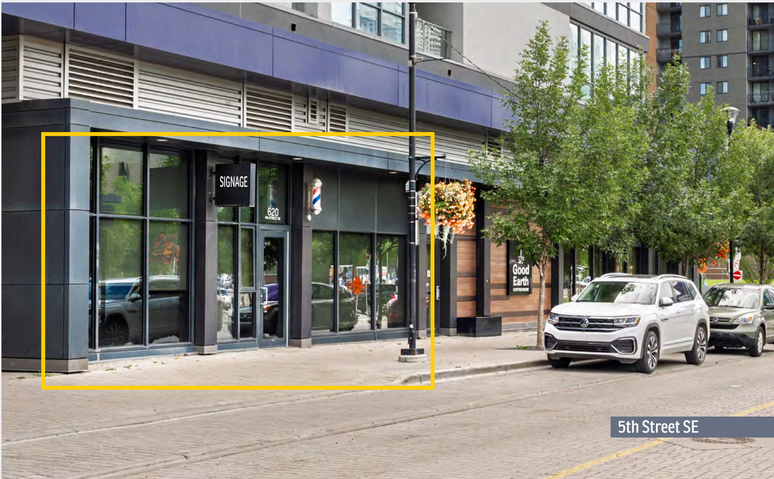
5th Street SE