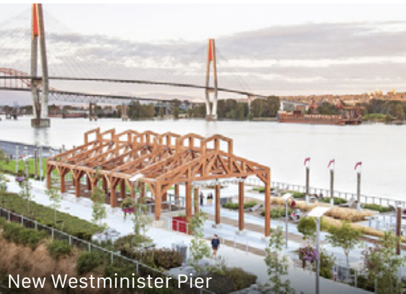
New Westminister Pier