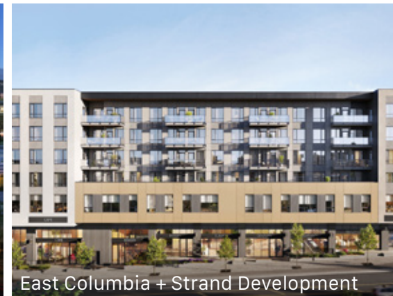
East Columbia + Strand Development