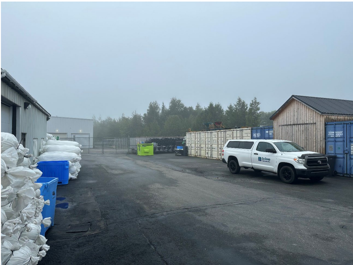
Paved and Fenced Yard