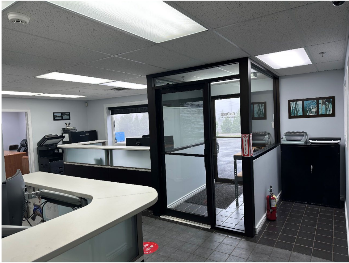
Entry Vestibule and Reception Area