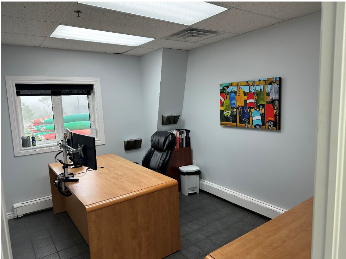
Office 2 - Front