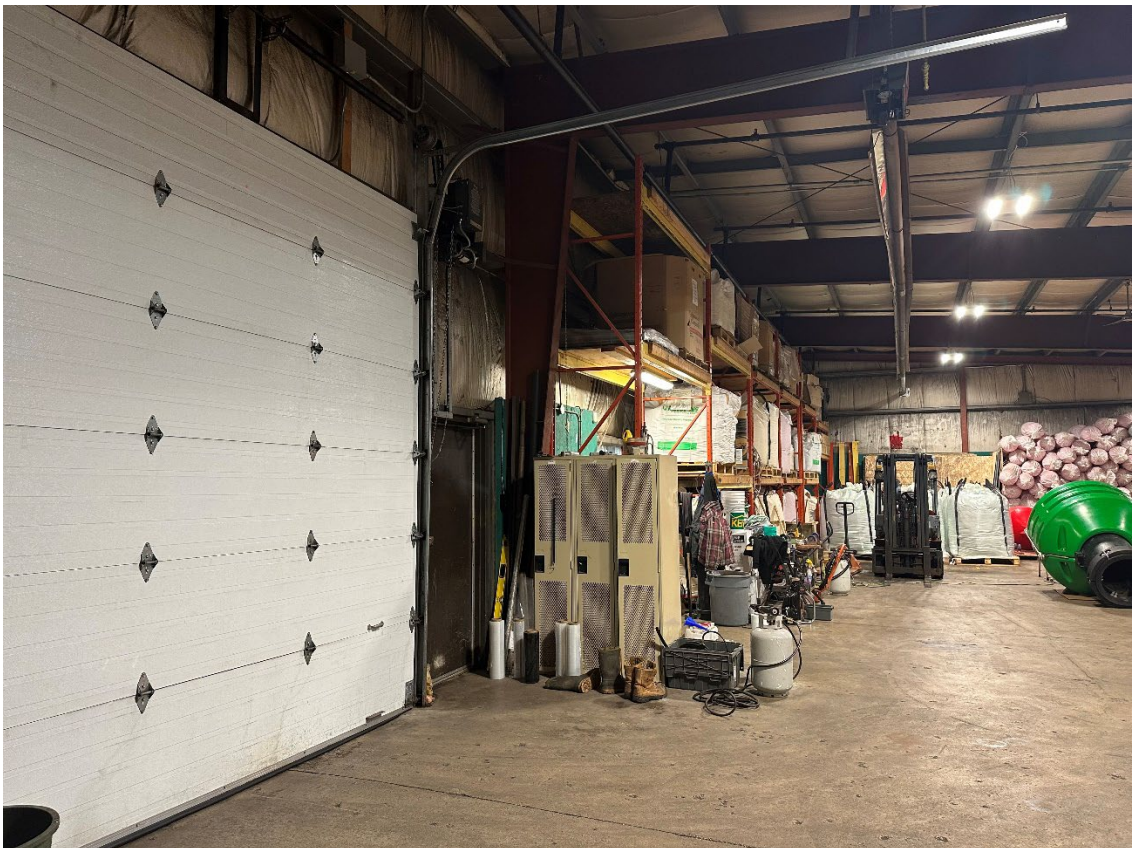
Overhead Door – 14' wide by 12' tall