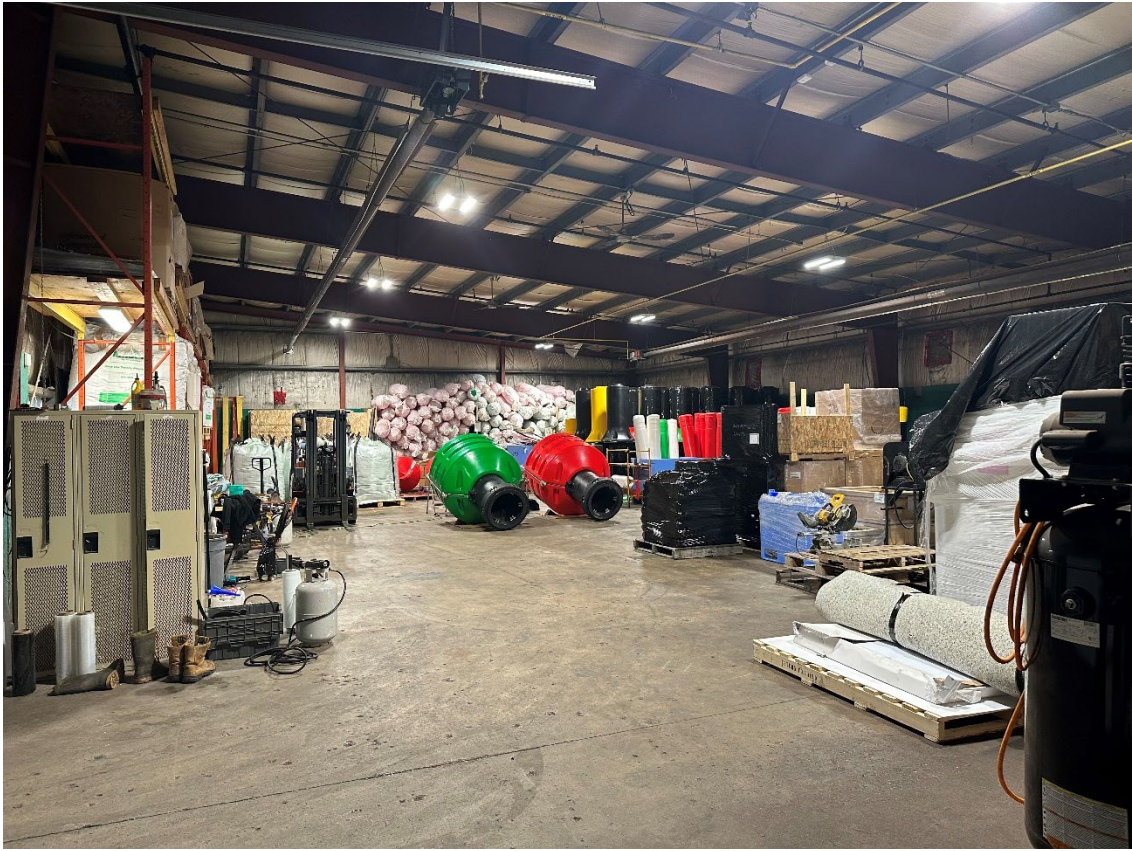
Connected Warehouse Building 2 (50' x 80')