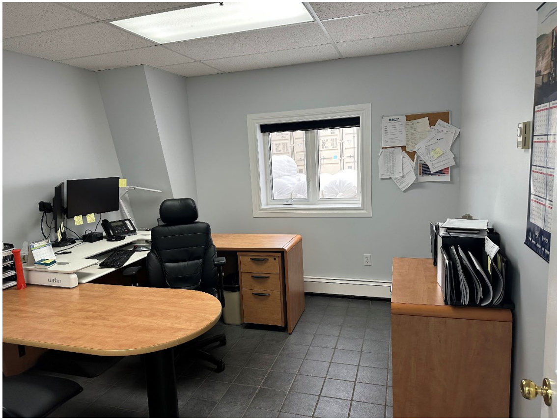
Office 3 - Front