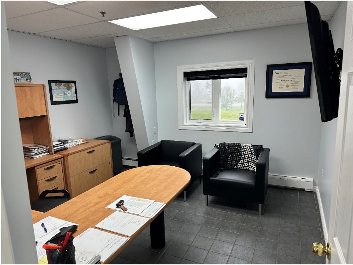
Office 1 - Front