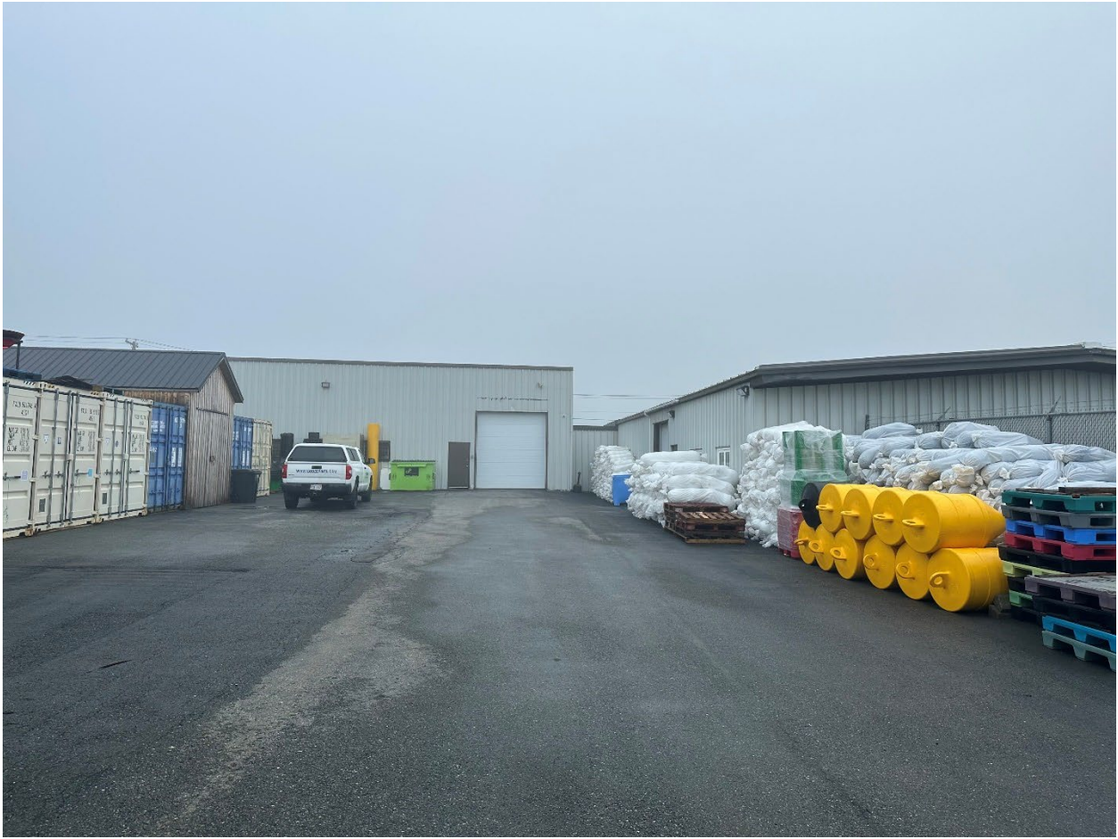
Building 1 and 2 from Entry Gate to Paved Yard