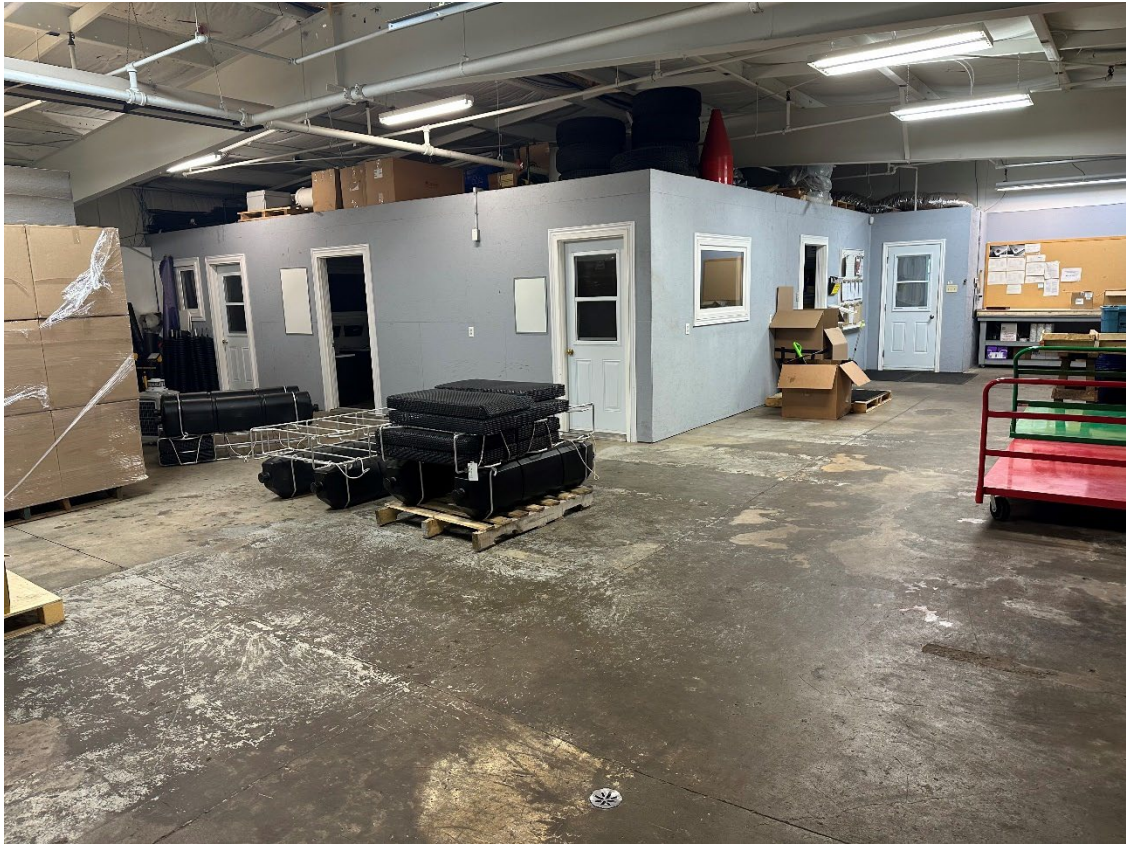
Parts Shop at rear of Building 1 with 5 Offices