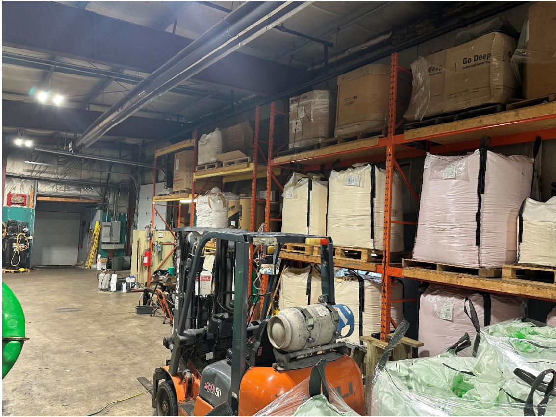
View of Entry to Building 1