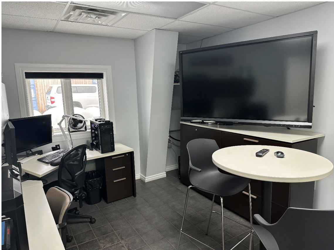
Office 4 - Front