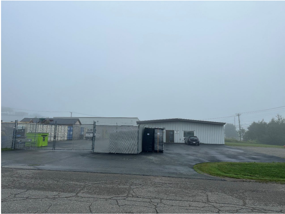
Entrance and Partially Paved Parking Area