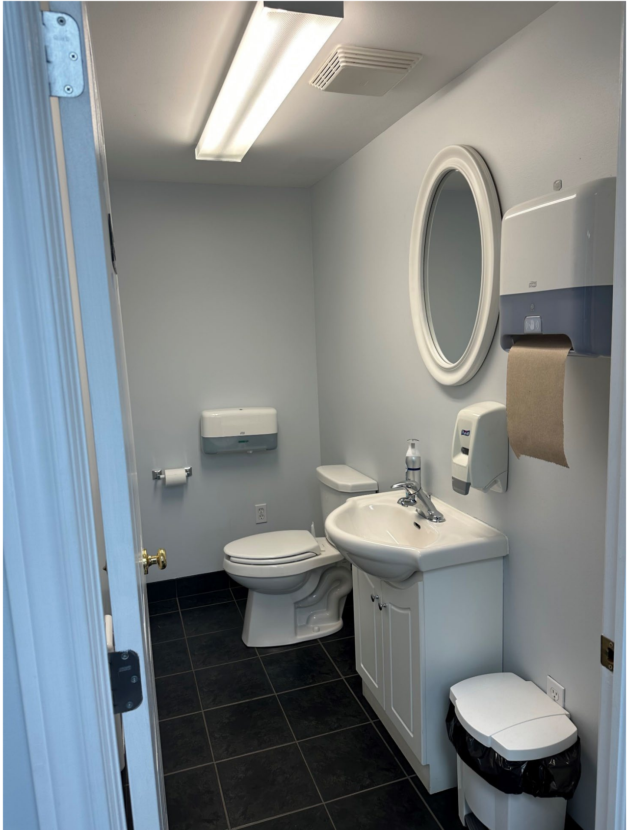
Washroom 1 – Reception Area