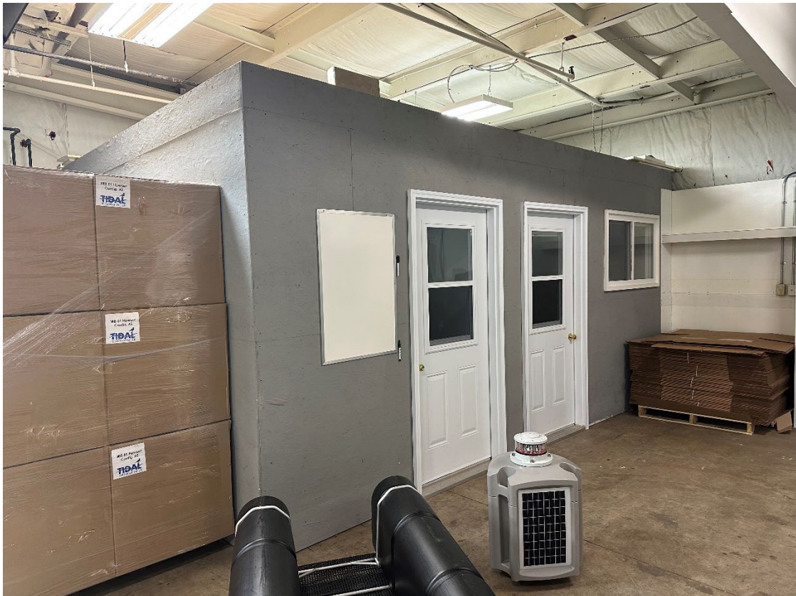
2 of the 5 Offices in the Parts Shop area that could be converted to a large Meeting Room