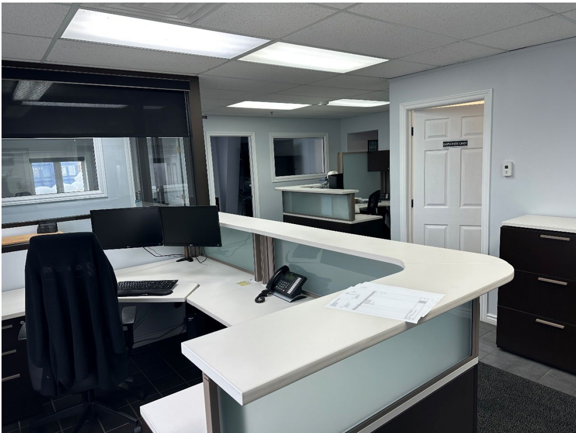
Reception Area with 2 Workstations