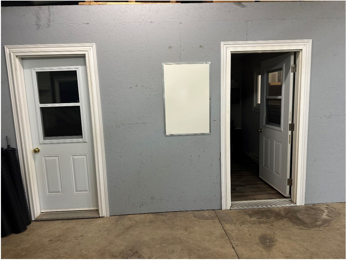
Parts Shop Offices