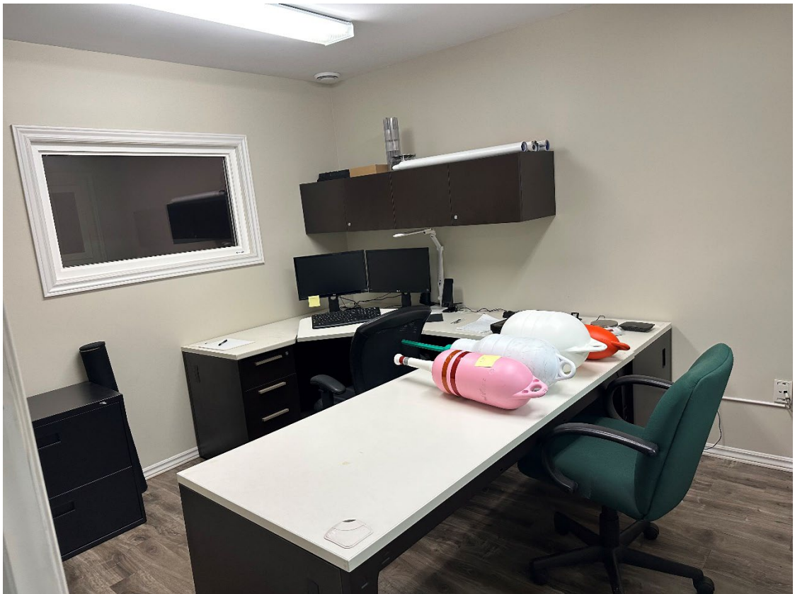
Example of finishes in the Parts Shop offices