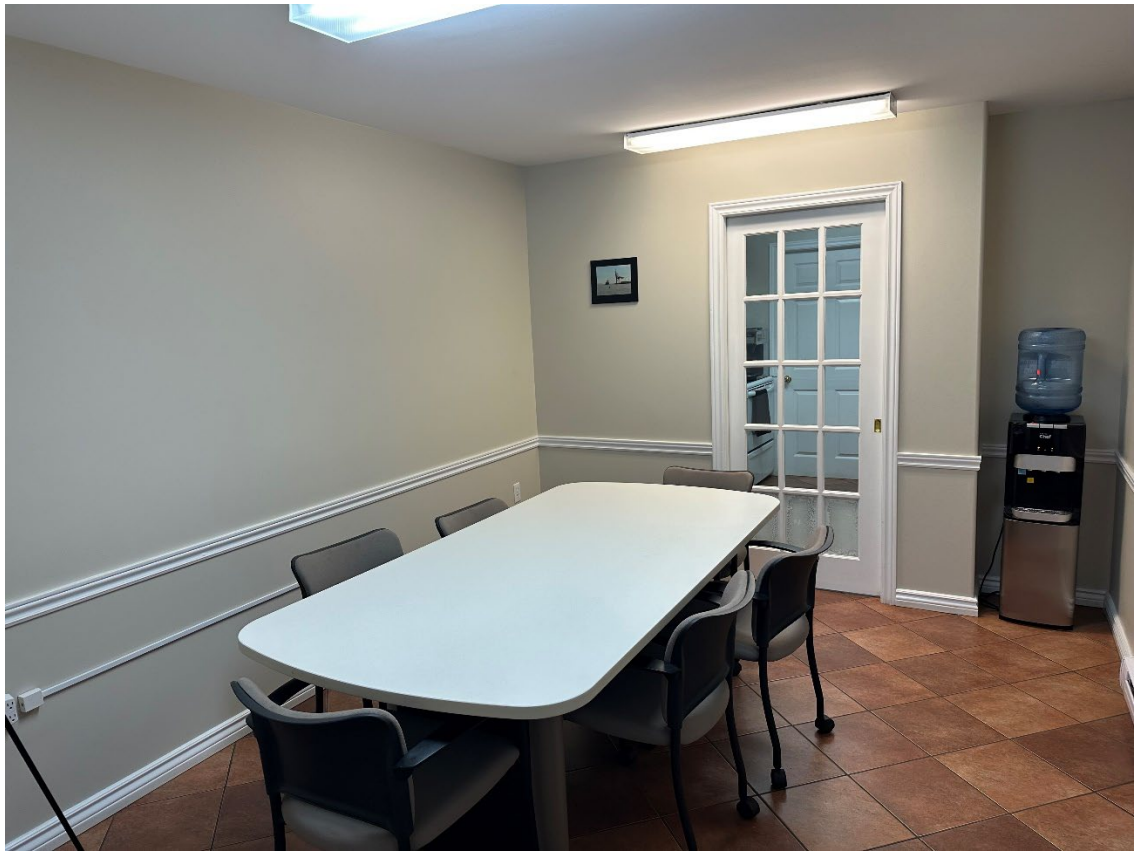
Lunchroom adjacent to Front Offices