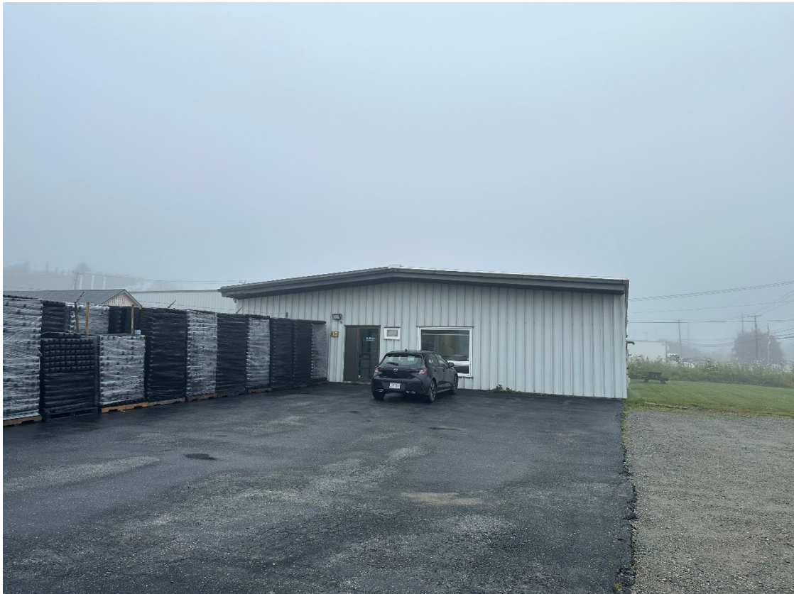
Entrance to Offices and Parts Shop in Building 1 (50' x 80')