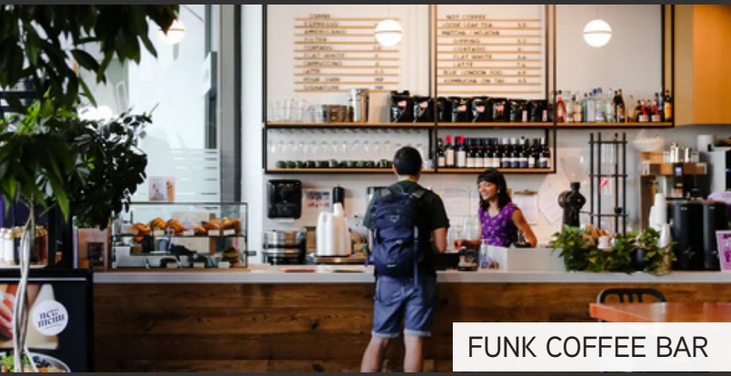
FUNK COFFEE BAR