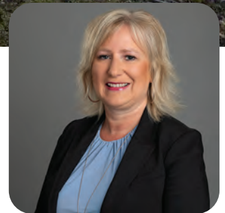
PROPERTY MANAGER & LEASING AGENT