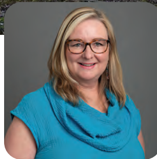
DIRECTOR OF REAL ESTATE

This 5,850 sq. ft. office & warehouse space, located on 128 Street, is a rare opportunity! It has 1,152 sq. ft. of office, 4,698 sq. ft. of warehouse, and 250 sq. ft. of mezzanine space, plus 2 washrooms. Come join the Anvil Way Industrial Centre today!