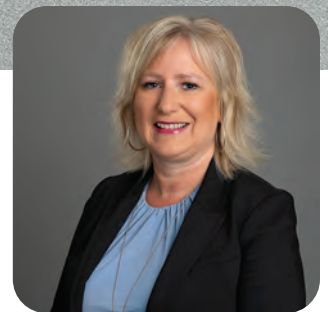
PROPERTY MANAGER & LEASING AGENT