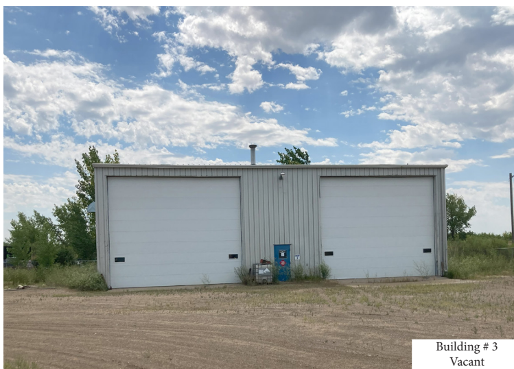
Building # 3 Vacant