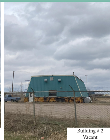
Building # 2 Vacant