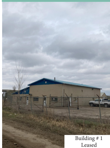
Building # 1 Leased