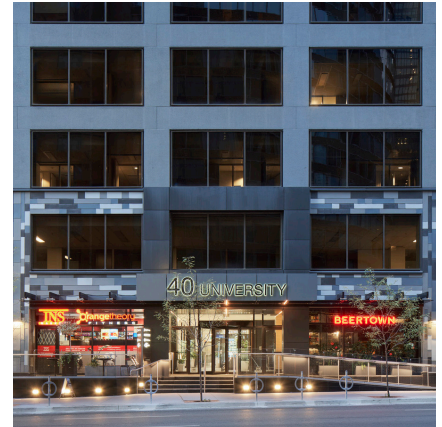
Exterior Street Level View

This document/communication has been prepared by Morguard Investments Limited ("MIL") for advertising and general information only. MIL makes no guarantees, representations, or warranties of any kind, expressed or implied, for the information including, but not limited to, warranties of content, accuracy, and reliability. Any interested party should undertake their own inquiries as to the accuracy of the information. MIL excludes all inferred or implied terms, conditions, and warranties arising out of this document as well as all liability for loss and damages arising therefrom. The information herein may change and any property described in the information may be withdrawn from the market at any time without notice or obligation to the recipient. This communication is not intended to cause or induce breach of an existing listing agreement. Morguard Investments Limited, Brokerage.