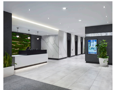
Interior Lobby View