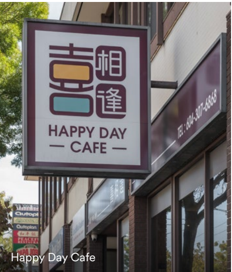
Happy Day Cafe