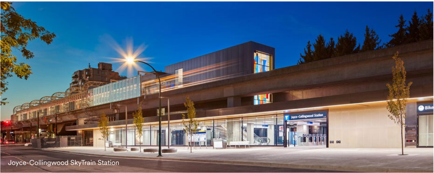
Joyce-Collingwood SkyTrain Station

3304 Kingsway is located in the bustling and diverse Joyce-Collingwood neighbourhood of East Vancouver, an area known for its thriving commercial activity and high pedestrian traffic. The property is a short distance from the Joyce-Collingwood SkyTrain Station, providing excellent accessibility and convenient connections to downtown Vancouver, Burnaby, and other key areas in the Lower Mainland. The surrounding area is home to a wide array of established businesses, including Safeway grocery store, eclectic markets, cafés and restaurants, all contributing to this prime retail destination. The daily foot traffic and visibility of the site is further enhanced by the busy elementary school directly across the street.