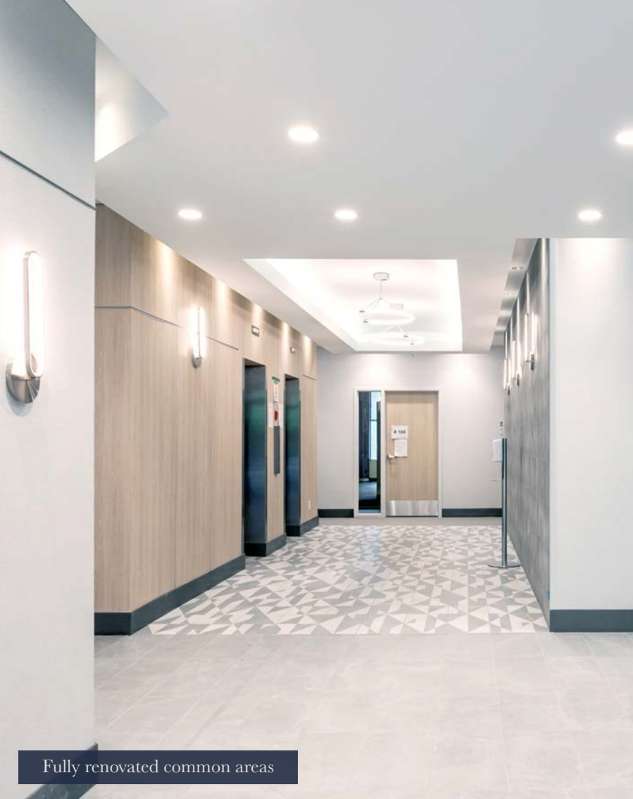
Fully renovated common areas