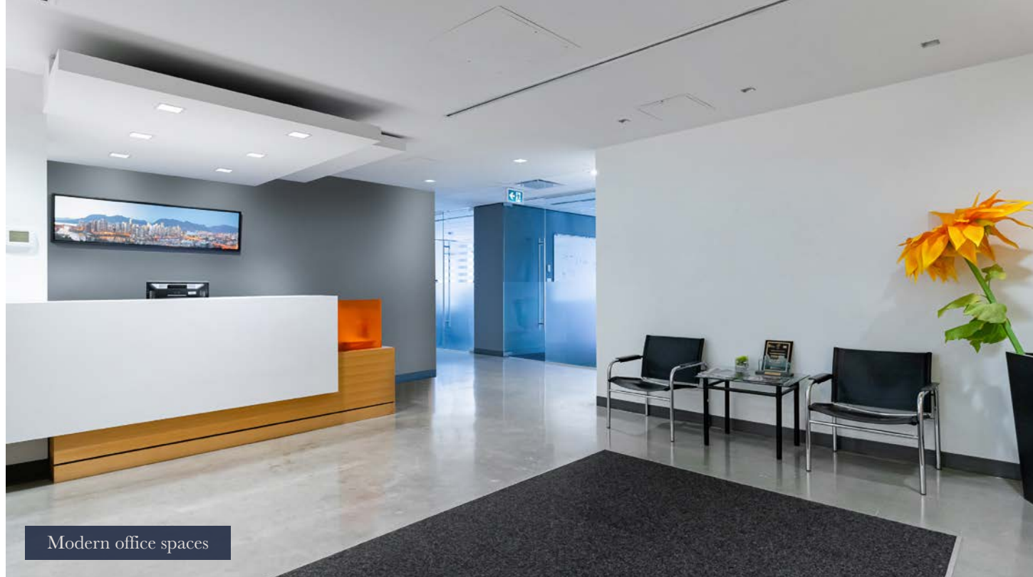
Modern office spaces