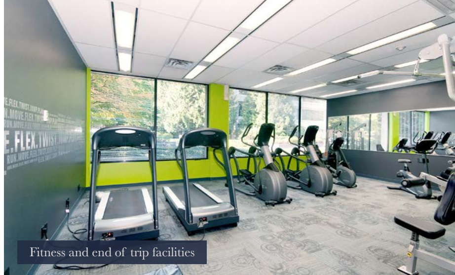
Fitness and end of trip facilities