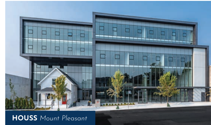
HOUSS Mount Pleasant

Capital investments bring long-term value, operating and mortgage interest expenses can be written off, and capital cost allowances provide tax savings.