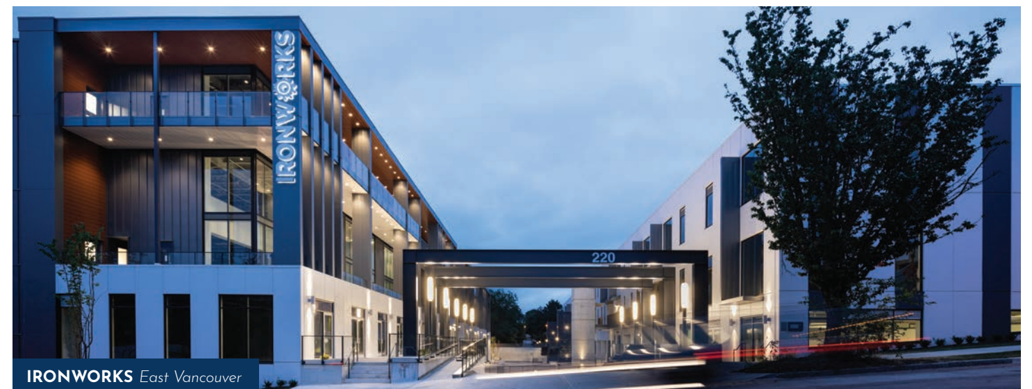
IRONWORKS East Vancouver

Conwest's reputation as a leader in the stacked industrial design movement began with the award-winning Ironworks , Canada's first stacked office and commercial industrial project. Occupying an entire city block in Vancouver's historically industrial Port Town