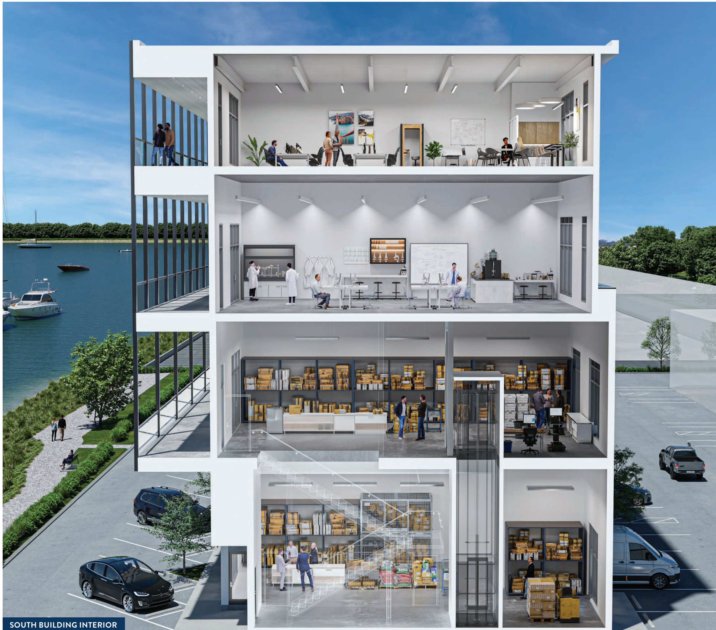
SOUTH BUILDING INTERIOR