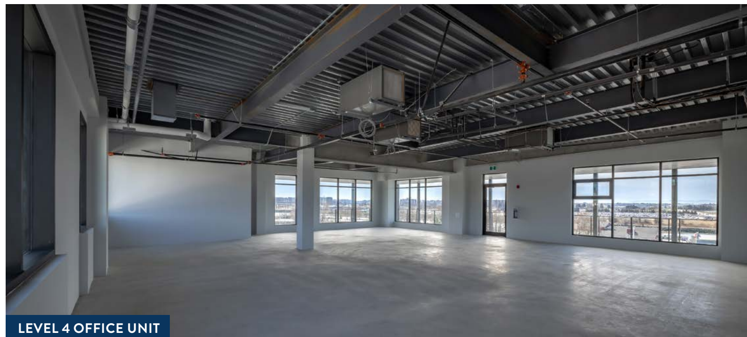
LEVEL 4 OFFICE UNIT