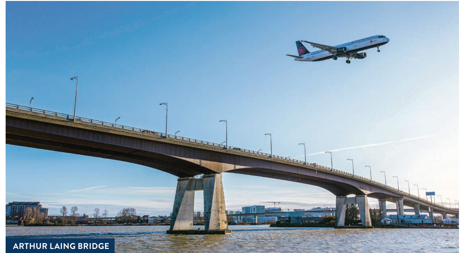
ARTHUR LAING BRIDGE