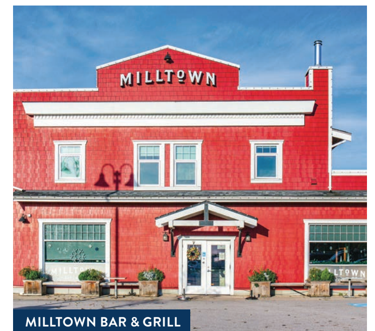
MILLTOWN BAR & GRILL