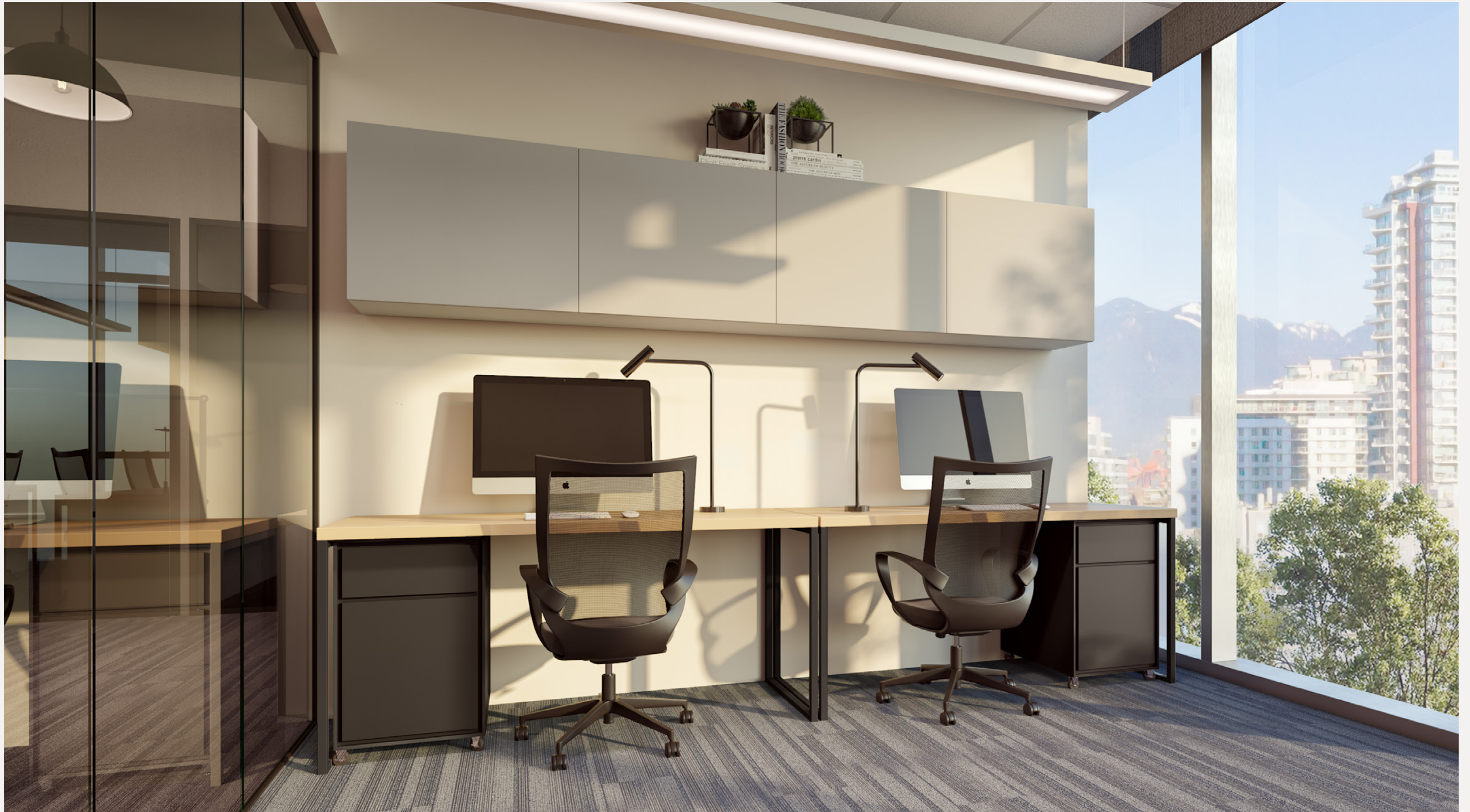
↑ Private Office