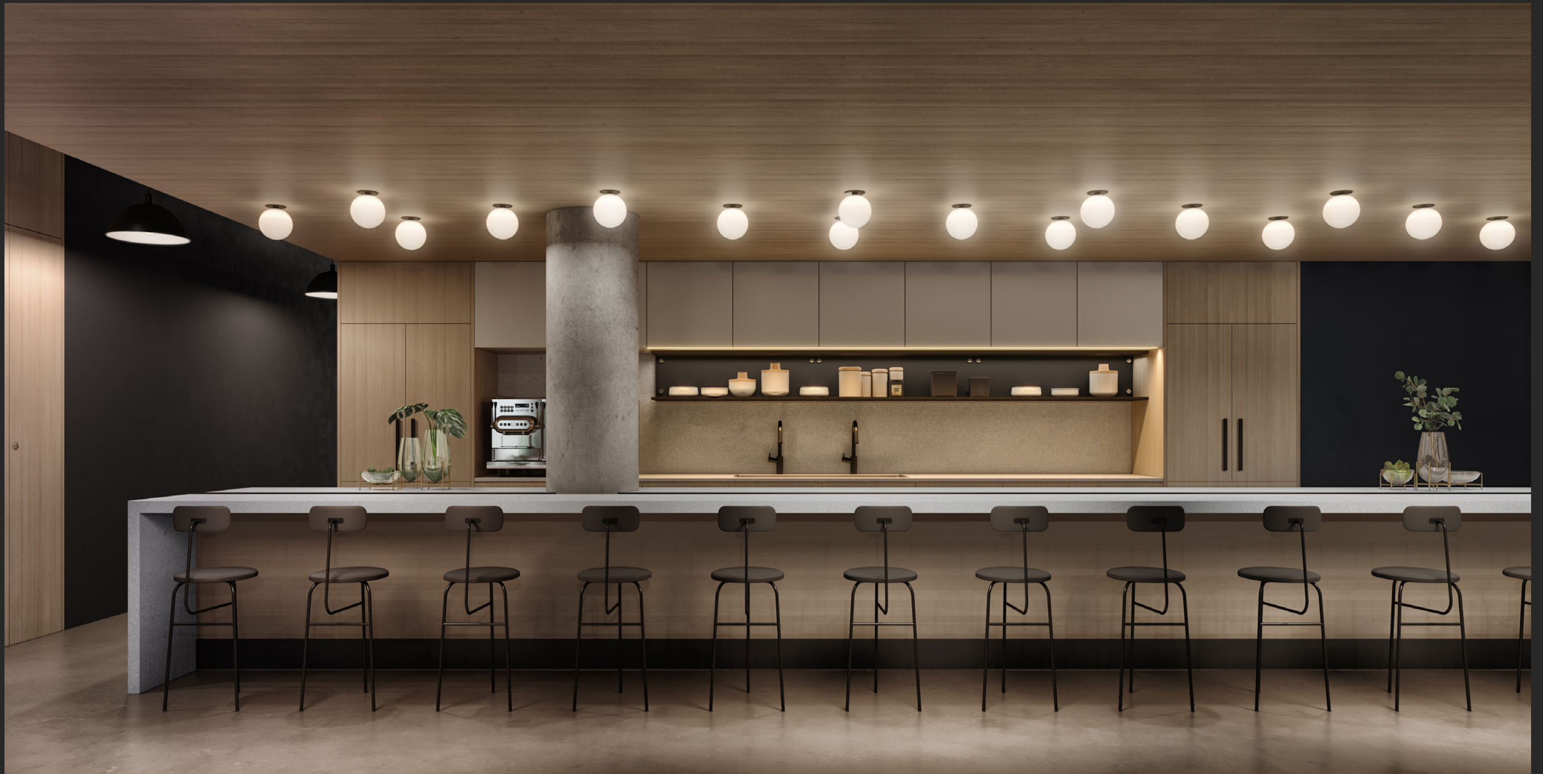
Communal Kitchen ↑