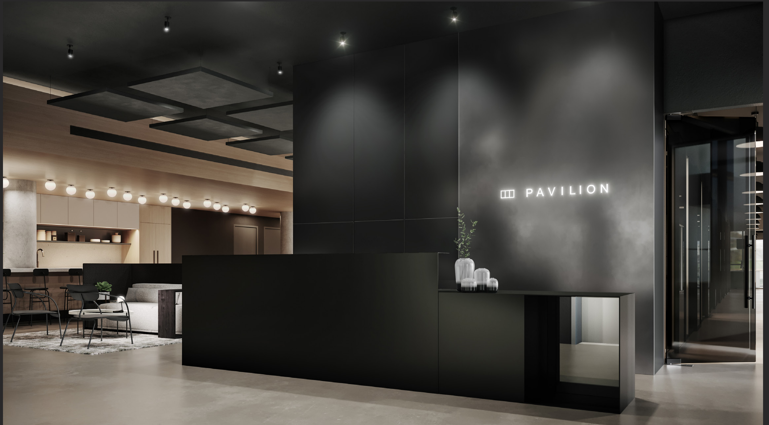
↑ Reception and Lounge