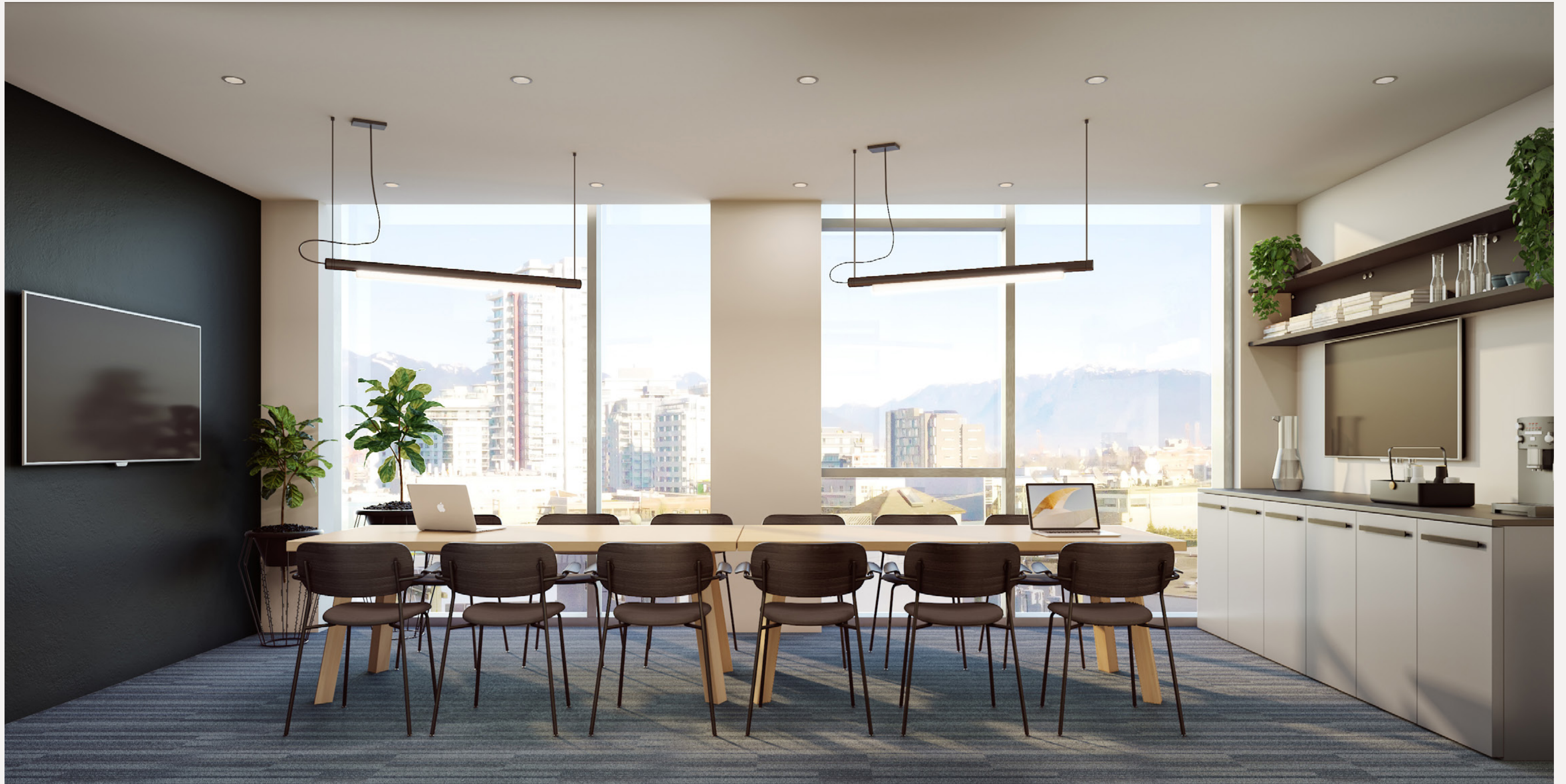
North Meeting Room with City View ↑