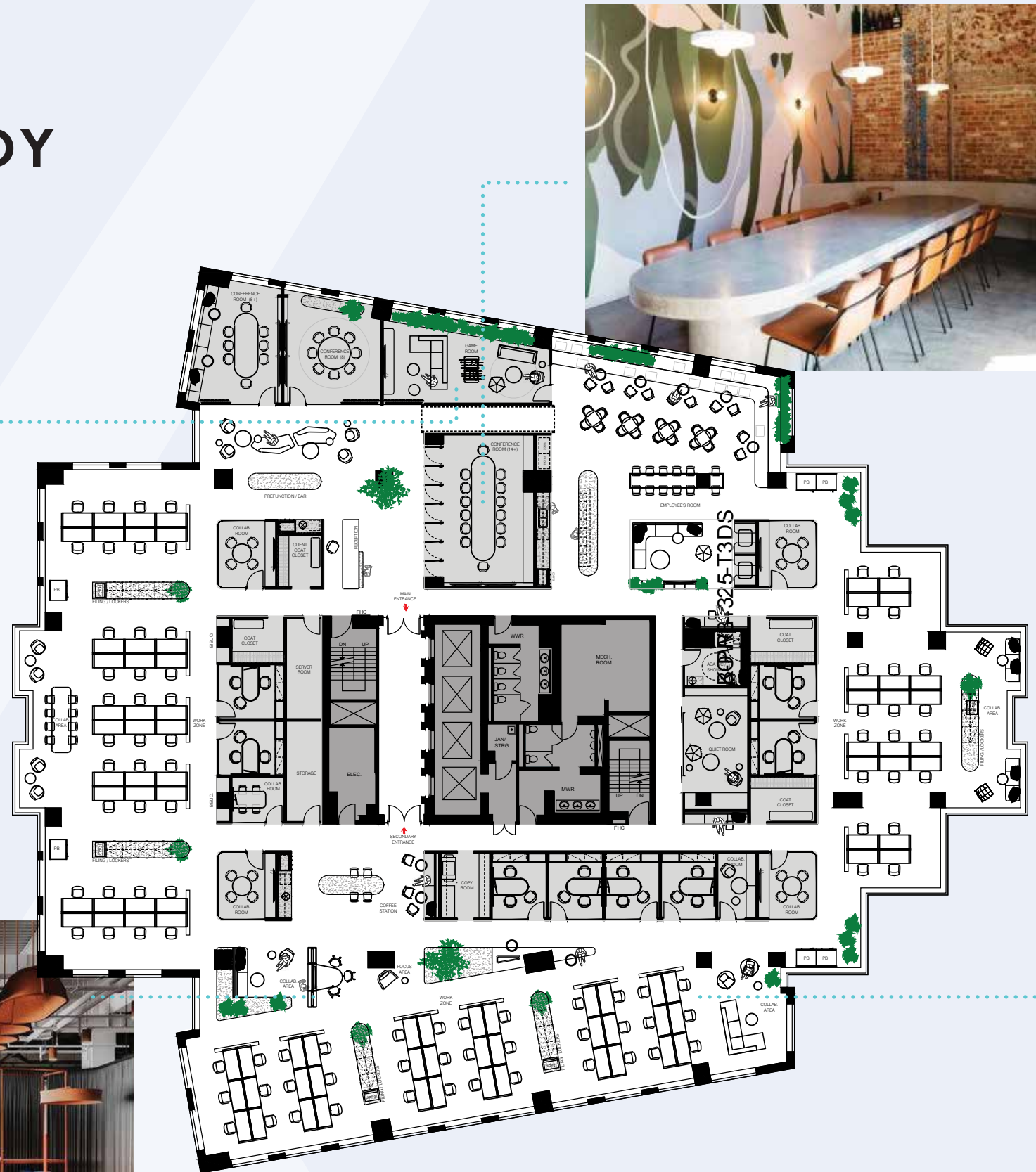
* Inspirational Imagery