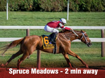
Spruce Meadows - 2 min away