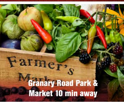
Granary Road Park & Market 10 min away