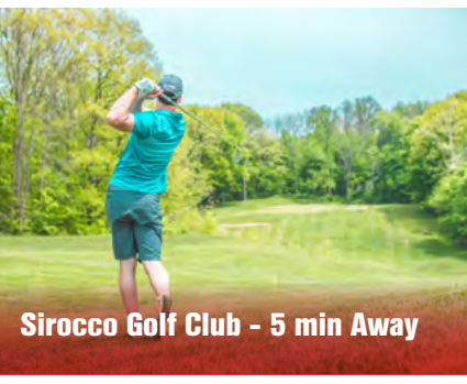
Sirocco Golf Club - 5 min Away