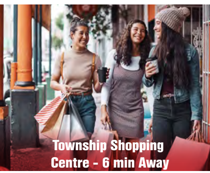
Township Shopping Centre - 6 min Away