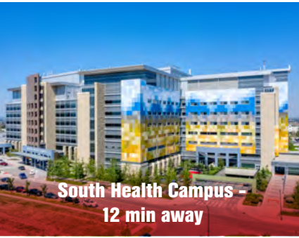
South Health Campus - 12 min away