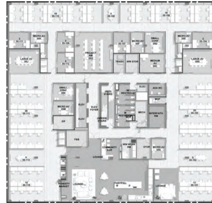
PLANS NOT TO SCALE