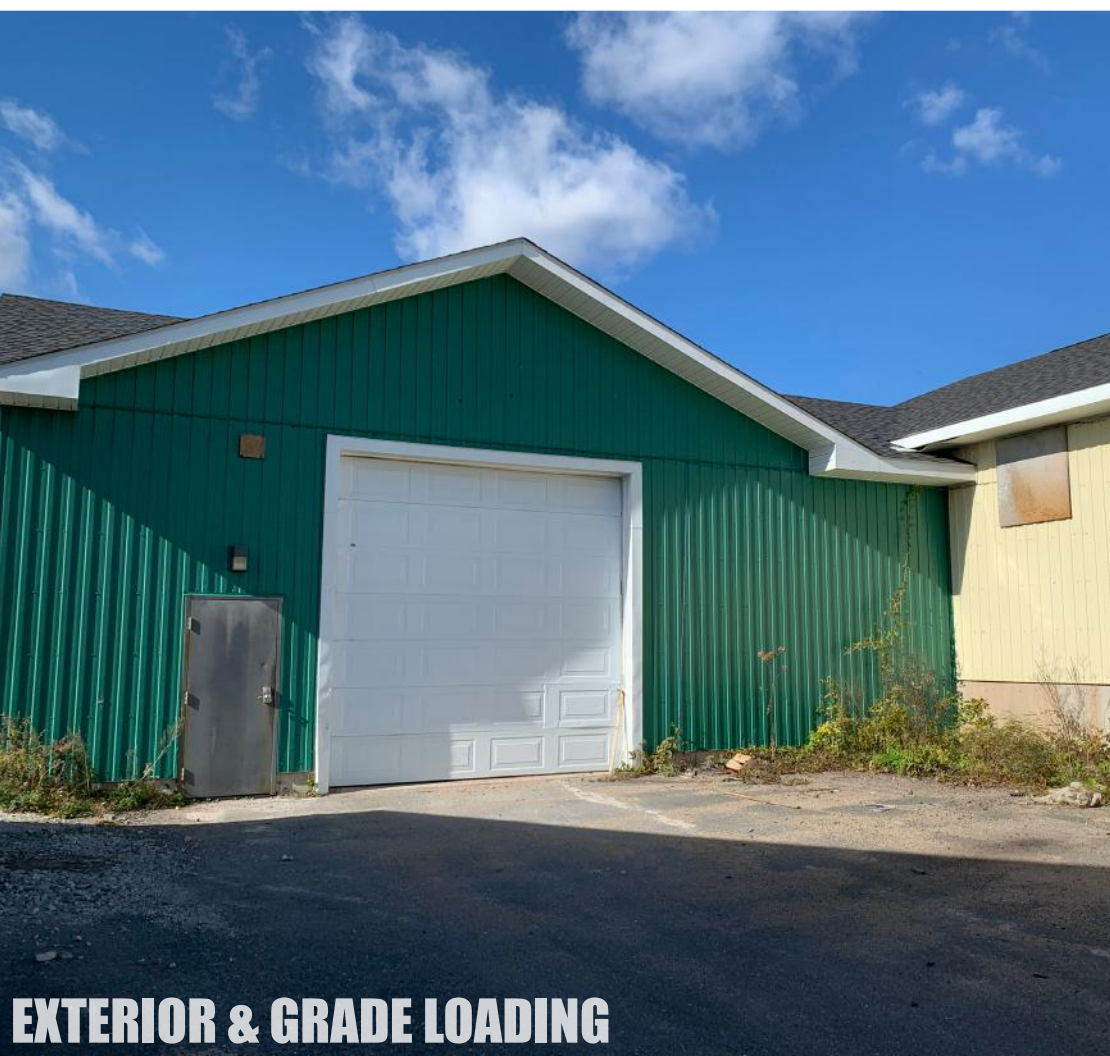
EXTERIOR & GRADE LOADING