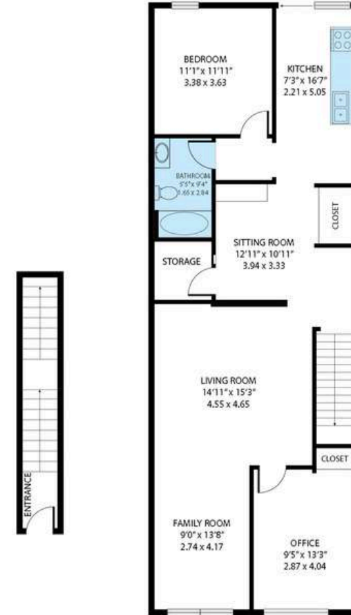
TWO SEPARATE RESIDENTIAL UNITS

FLEXIBLE LAYOUT ACROSS ALL LEVELS SUITABLE FOR A VARIETY OF COMMERCIAL USES