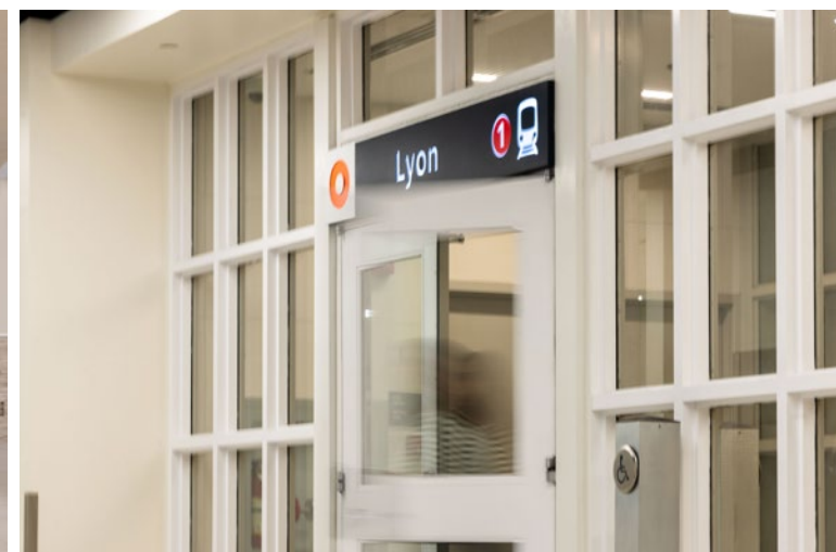
Direct access to the LRT