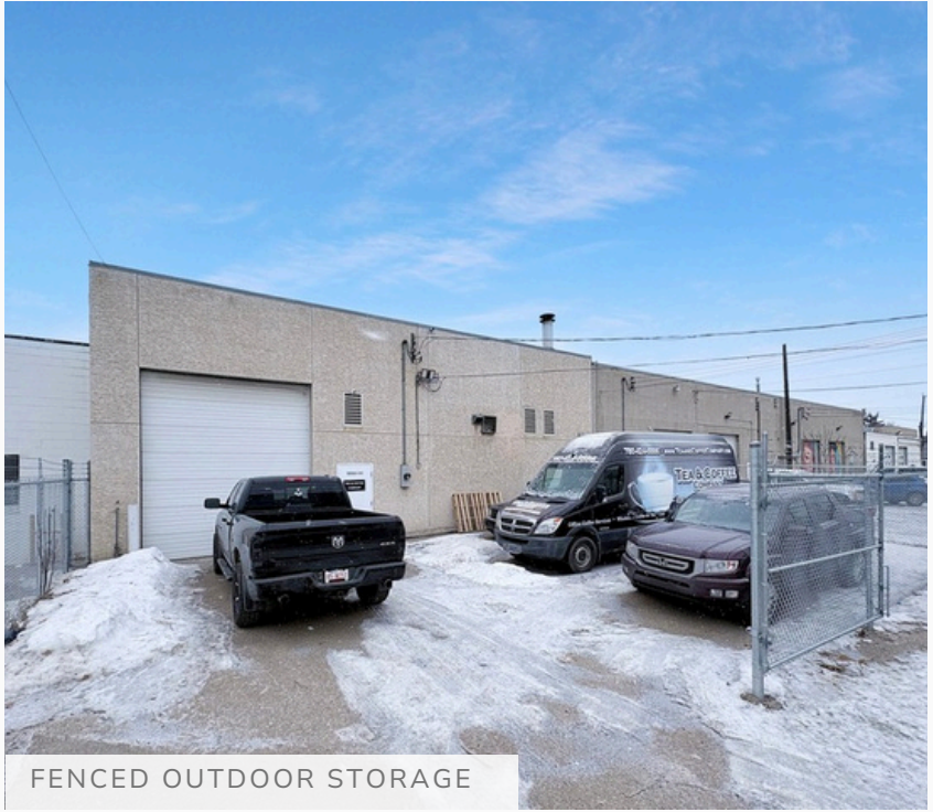
FENCED OUTDOOR STORAGE