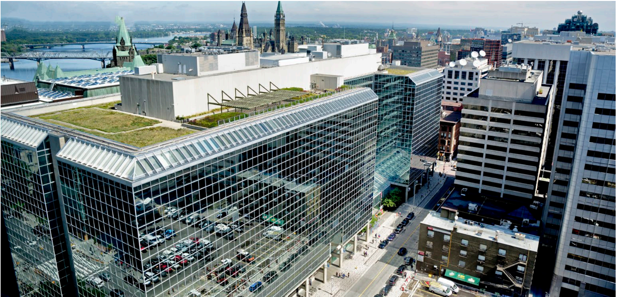
Stunning views from 22nd floor of Parliament & Ottawa River