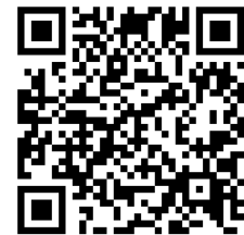
MODEL SUITE AVAILABILITIES