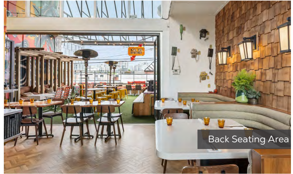
Back Seating Area