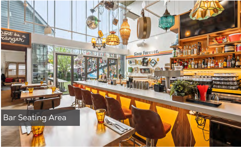
Bar Seating Area