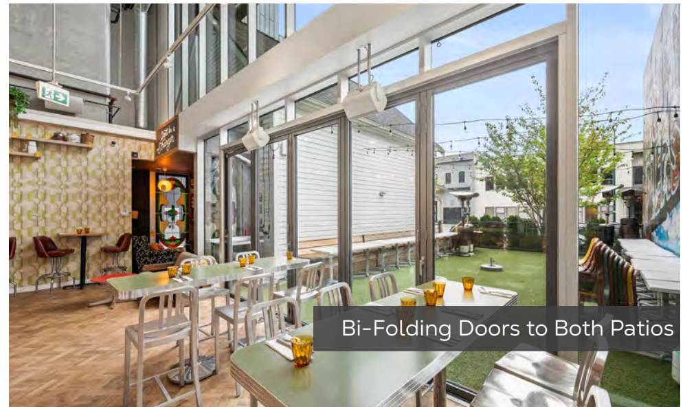
Bi-Folding Doors to Both Patios