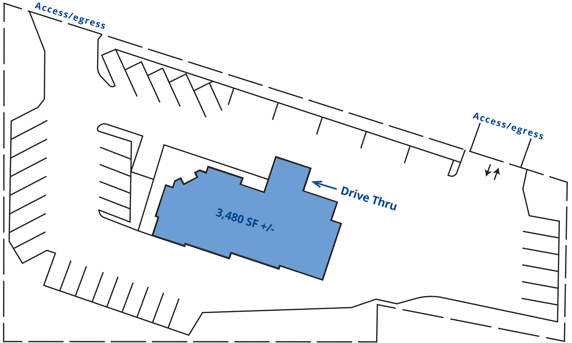
SITE PLAN _____