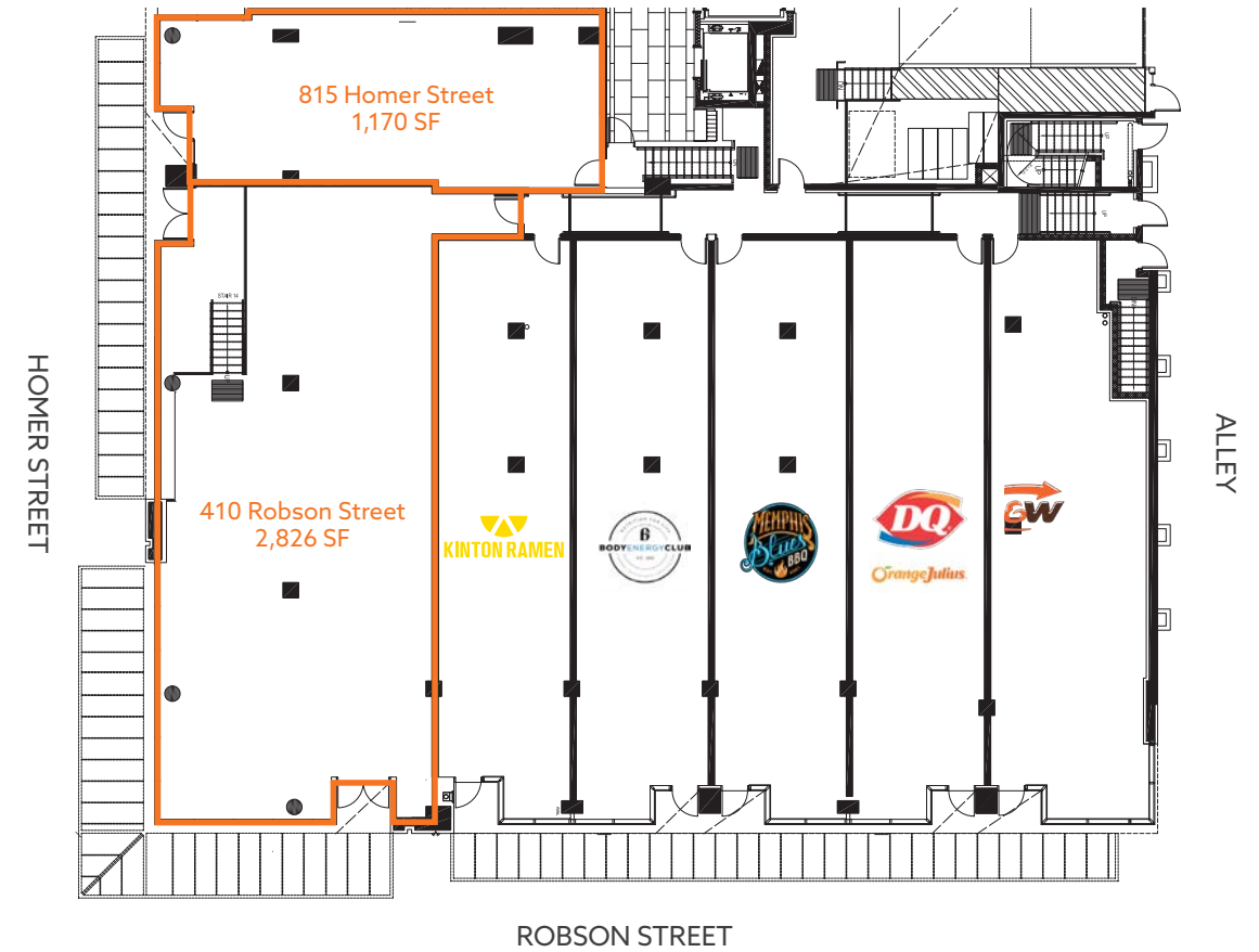
Plan shown above is only the northern portion of the Level 1 Atelier building plan.