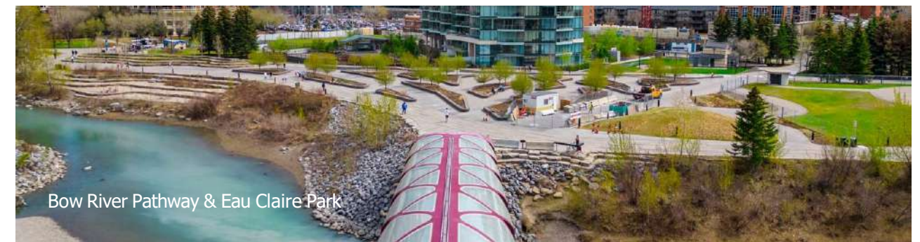
Bow River Pathway & Eau Claire Park