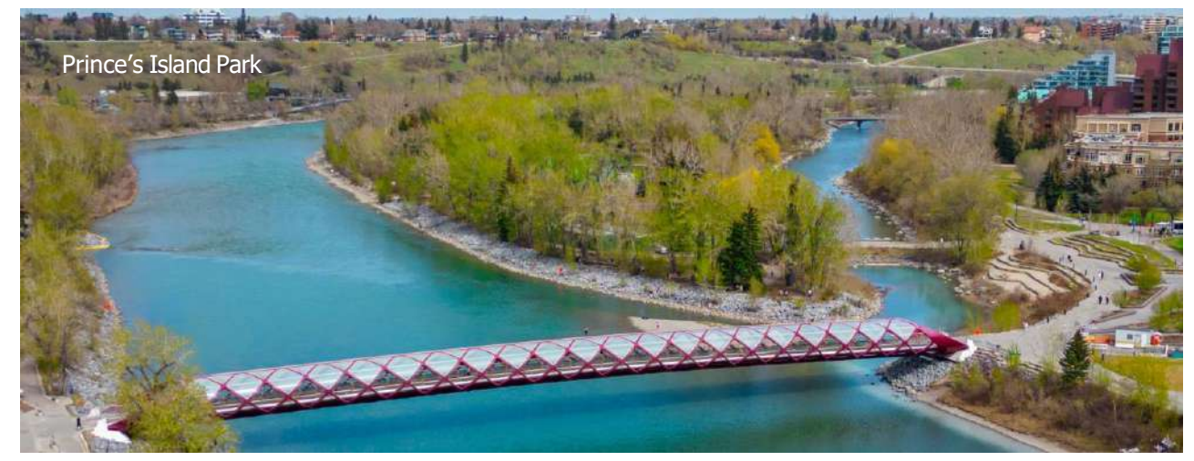
Prince's Island Park