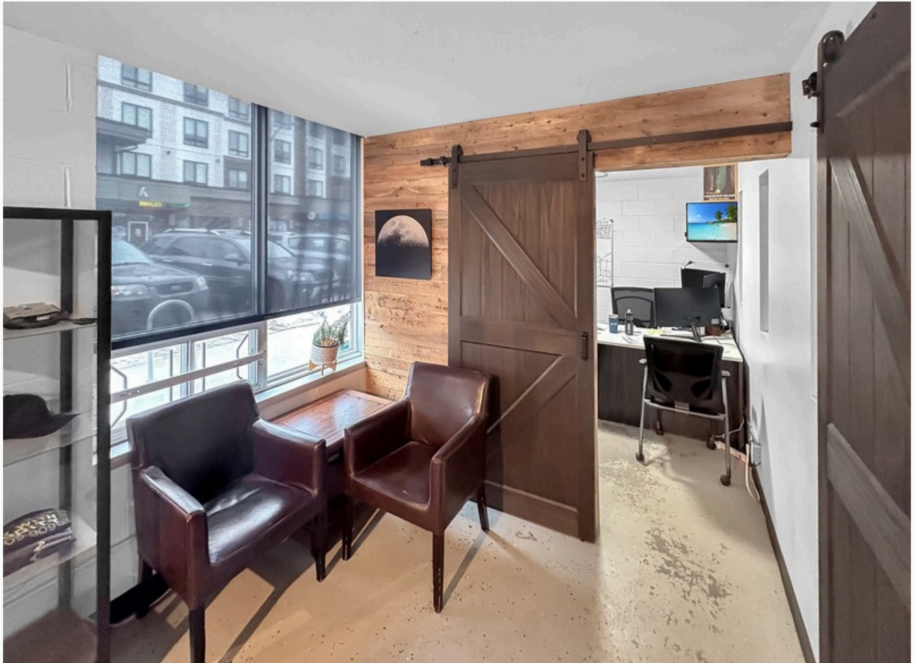
A STATEMENT ENTRANCE Natural light and rich wood tones