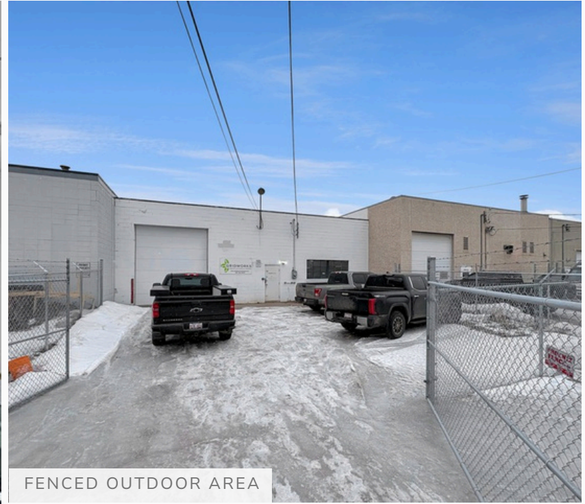
FENCED OUTDOOR AREA