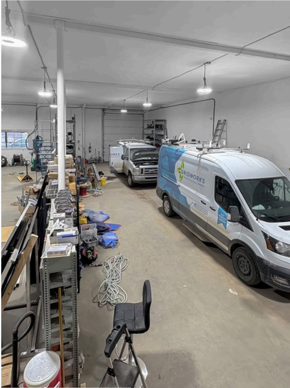
OPEN WAREHOUSE DESIGN