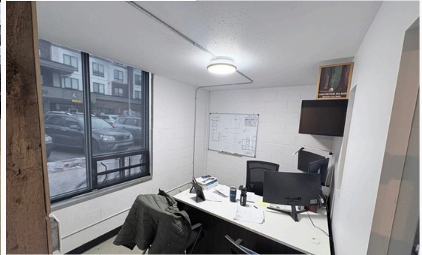
PROFESSIONAL OFFICES WITH WINDOWS