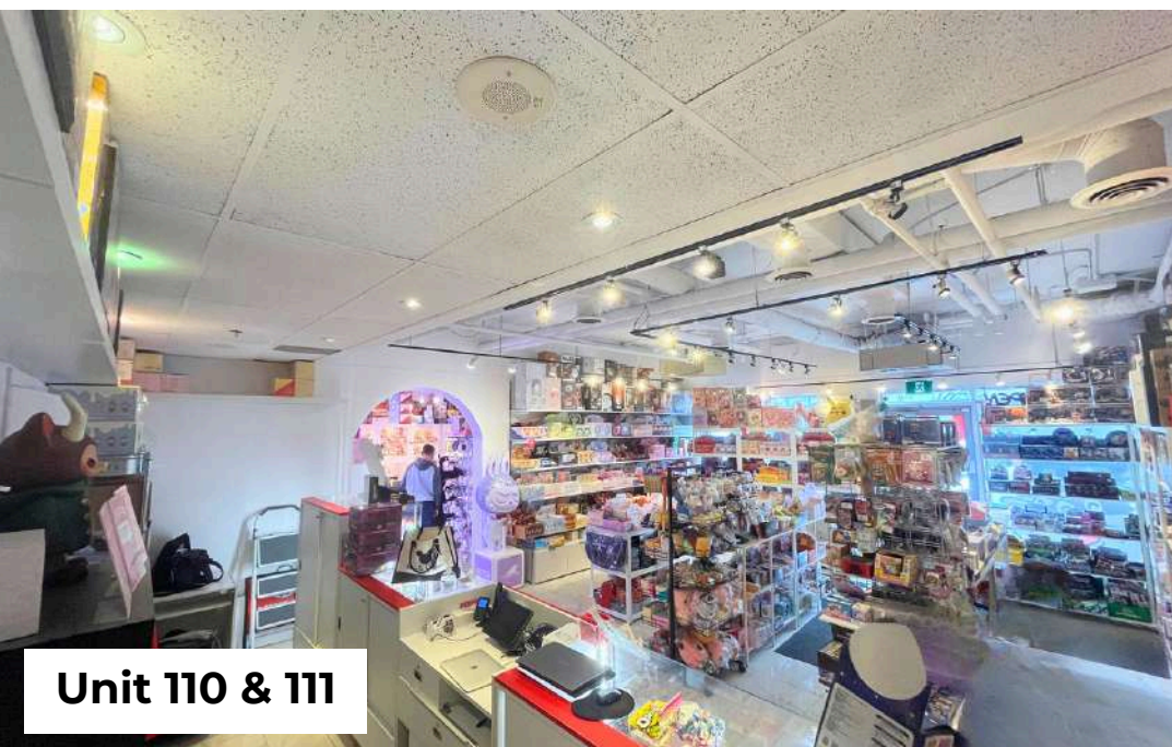
Unit 110 & 111